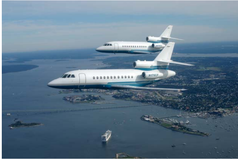
2002 Dassault Falcon 900EX Serial Number 110, N176CL