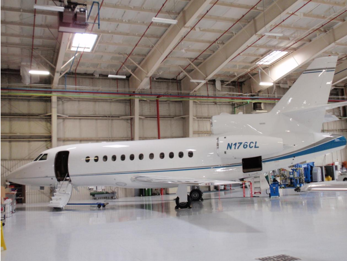
This picture shows NEW EXTERIOR PAINT June 2009