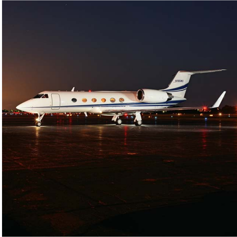
1988 Gulfstream IV Serial Number 1050, N195WS