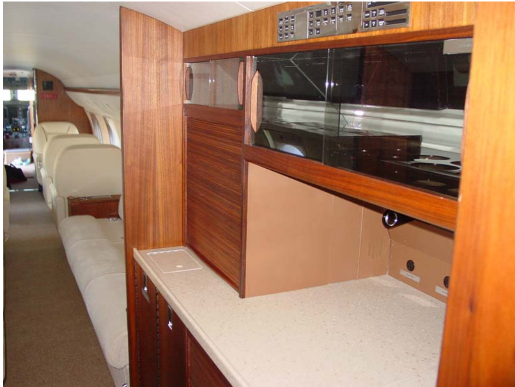
This aircraft interior was refurbished summer 2006. See below for color swatches and interior layout.