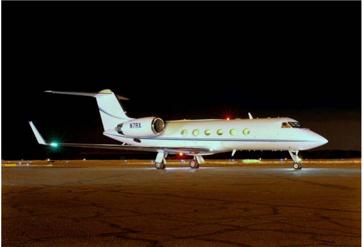
1990 Gulfstream IV Serial Number 1137, N7RX