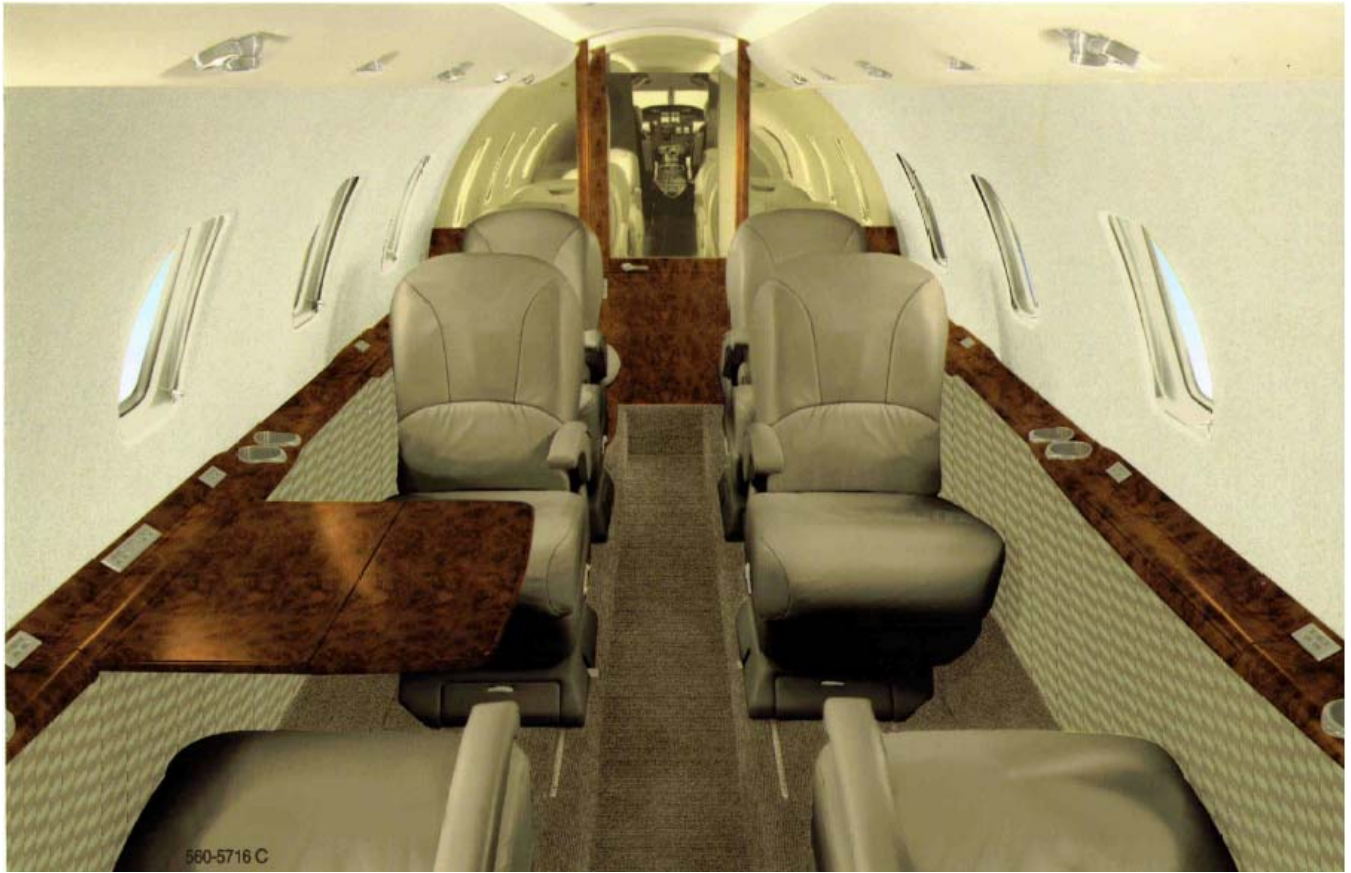
This is a computer rendering of the completed interior.