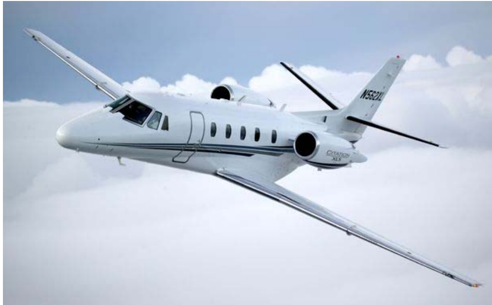
Citation XLS Serial Number 560-5716 (Delivers June 2007)