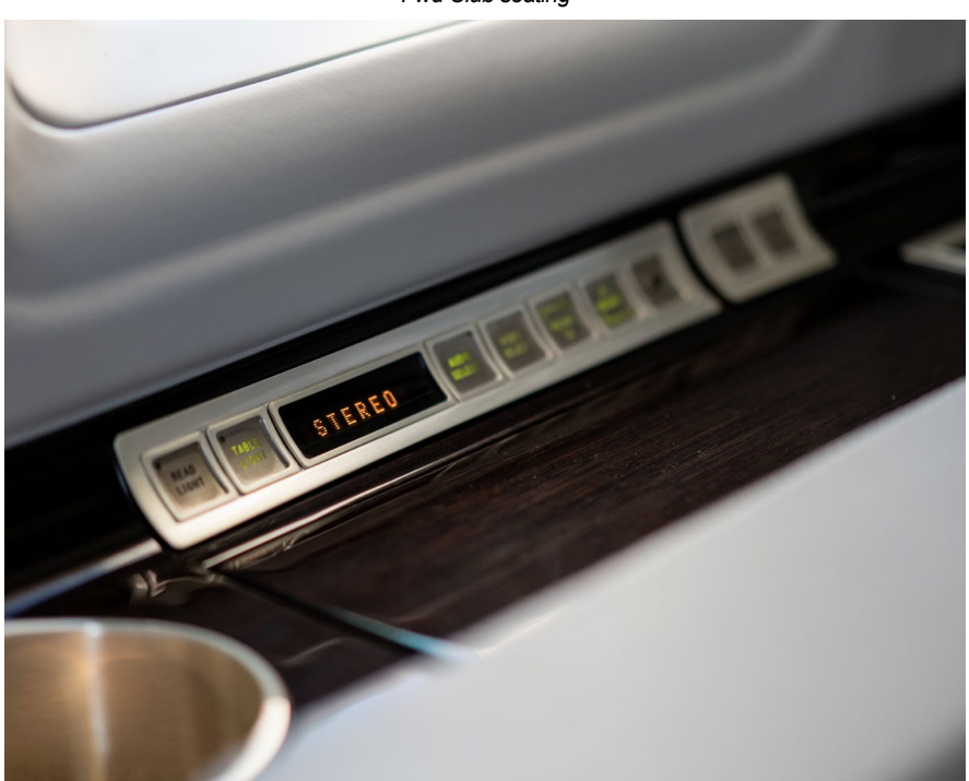
Fwd Cabin Controls