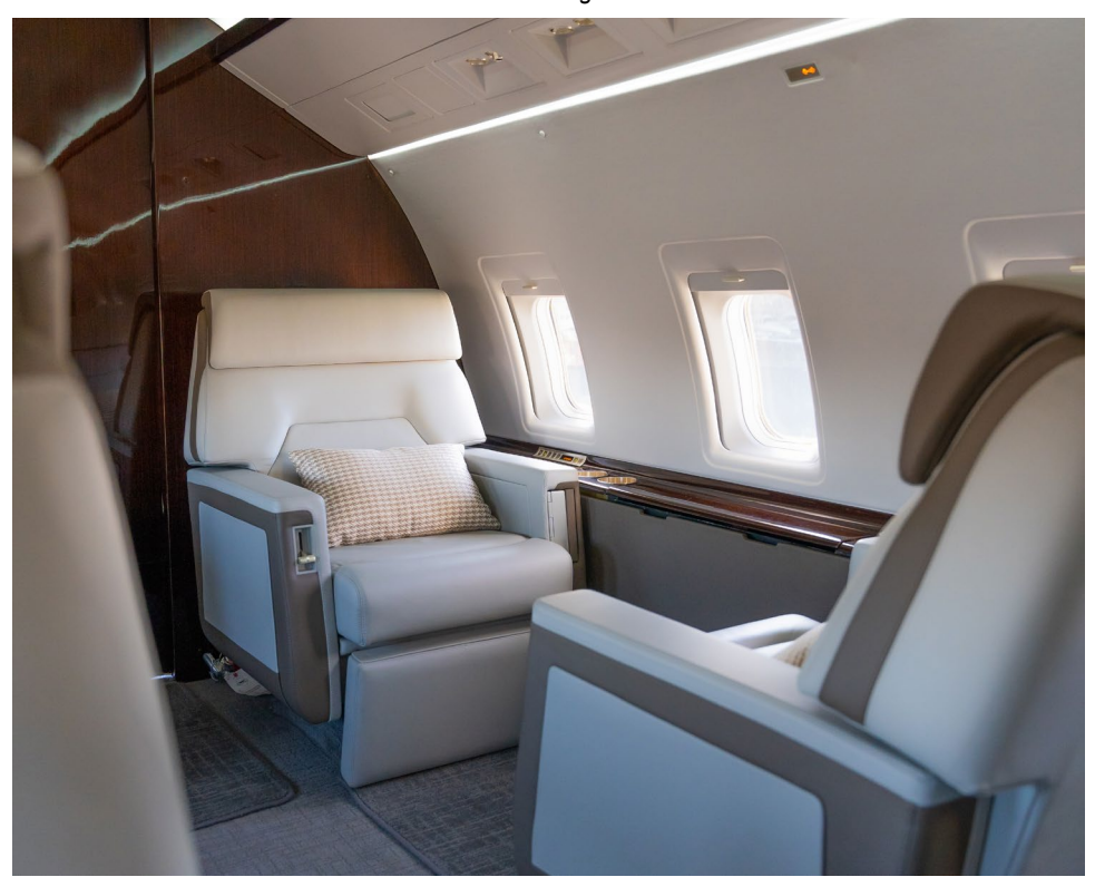
Fwd Club Seating