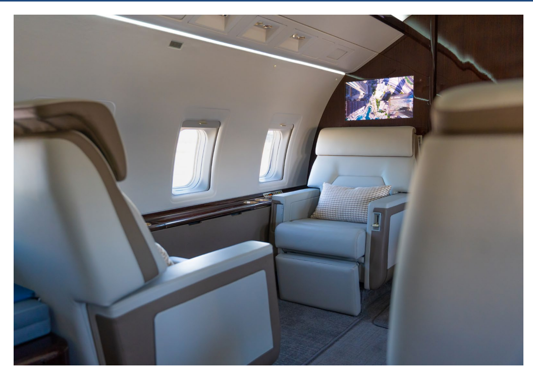
Fwd Club seating