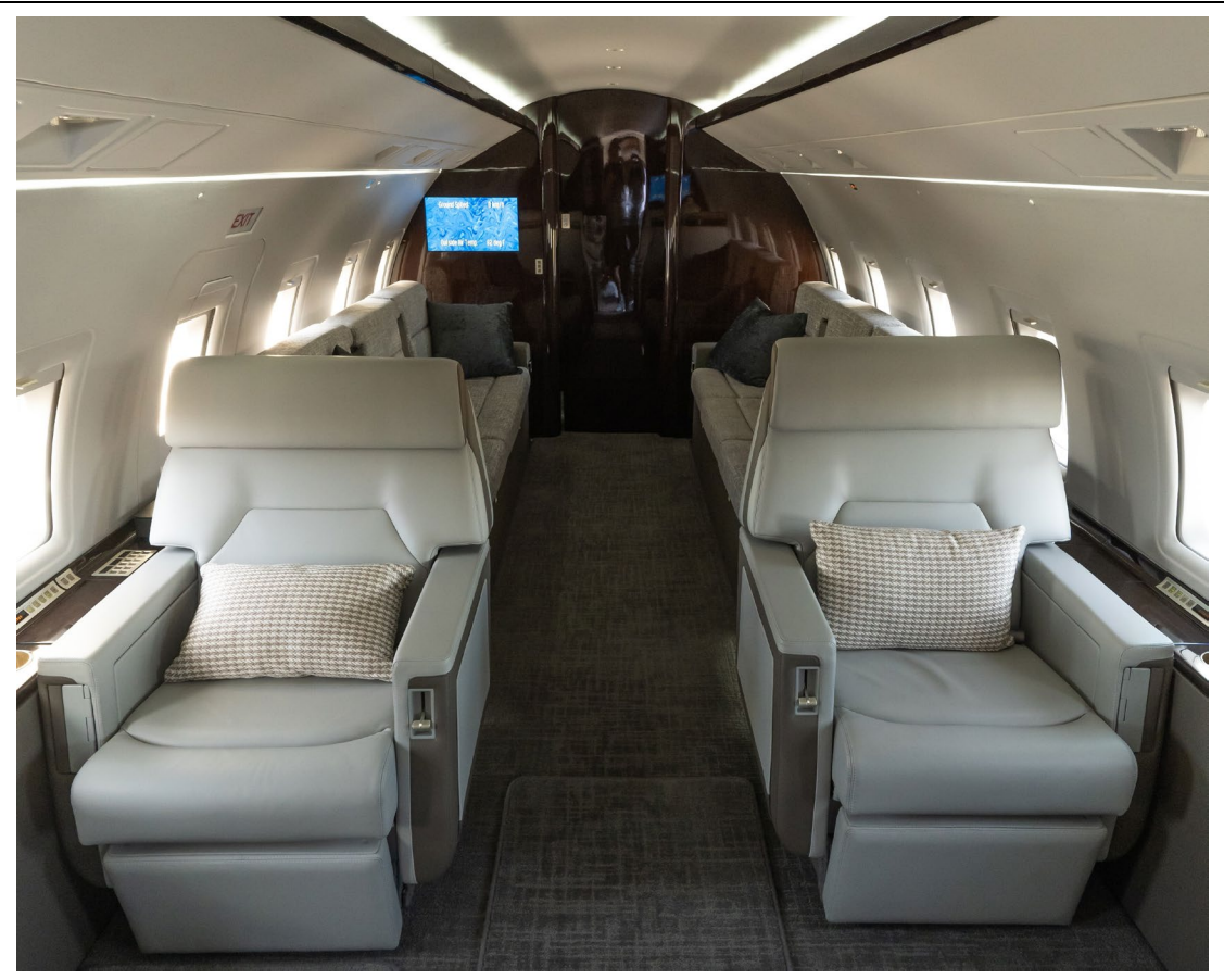
Fwd Cabin Looking Aft

Twelve (12) passenger cabin features a Four (4)-place forward club, preceding Two (2) Four (4)-place divan and a spacious aft lavatory.