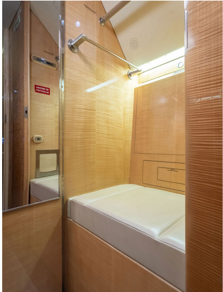
Forward Crew Lavatory