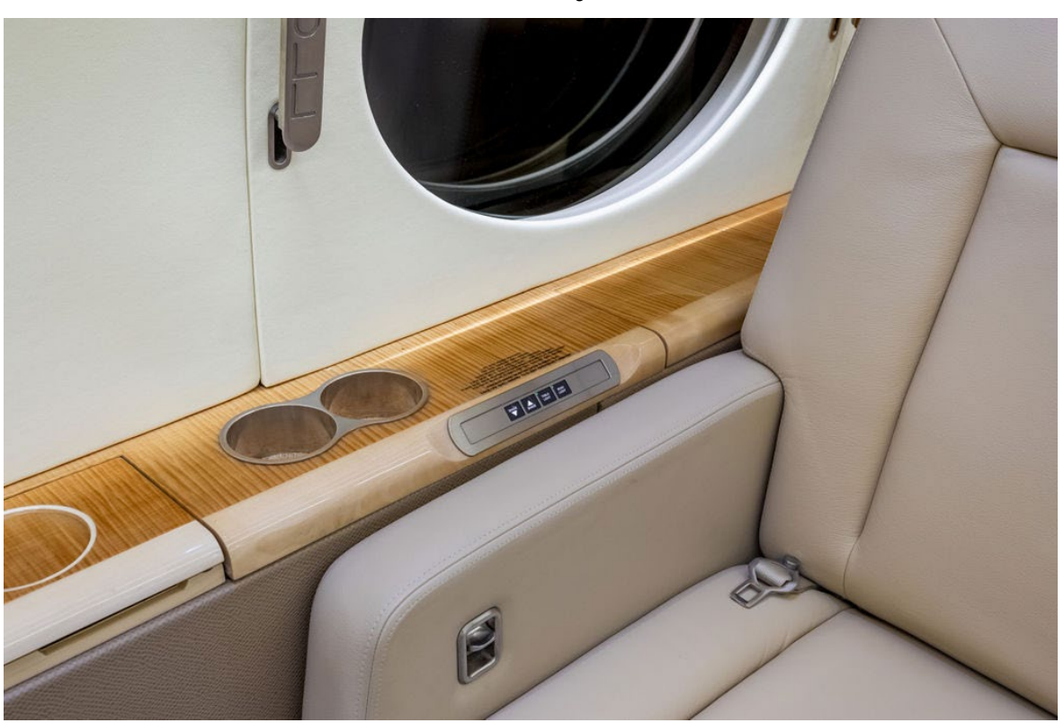
VIP Seat facing Forward