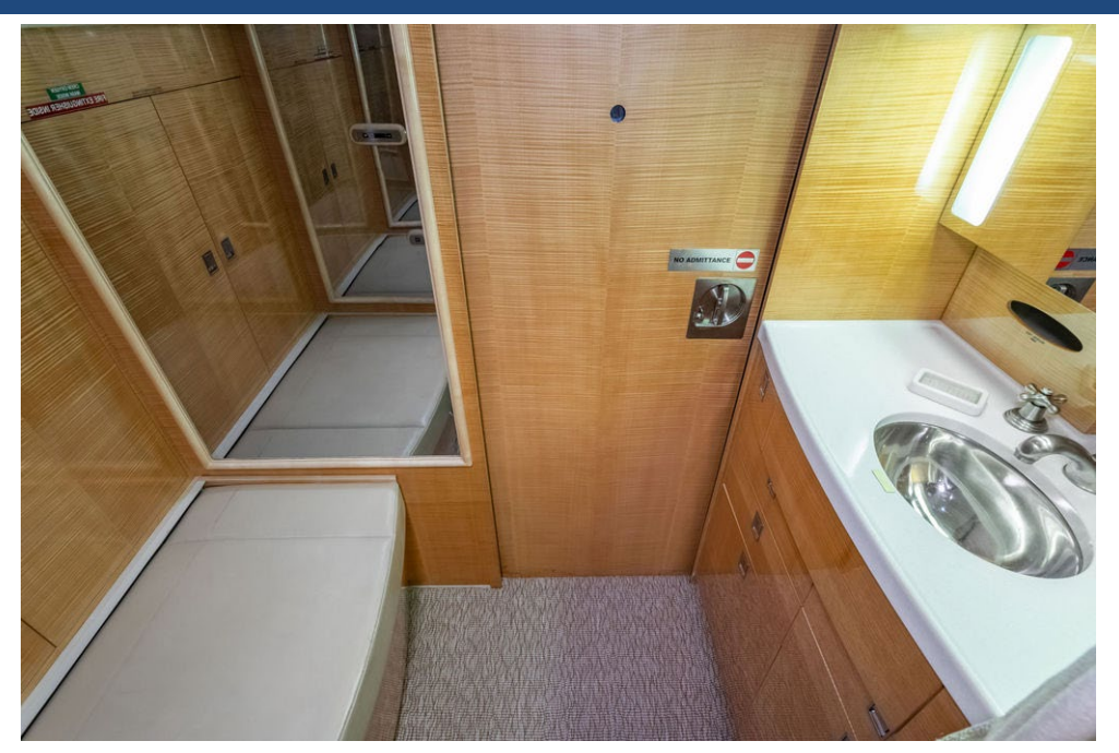
Aft Cabin Lavatory