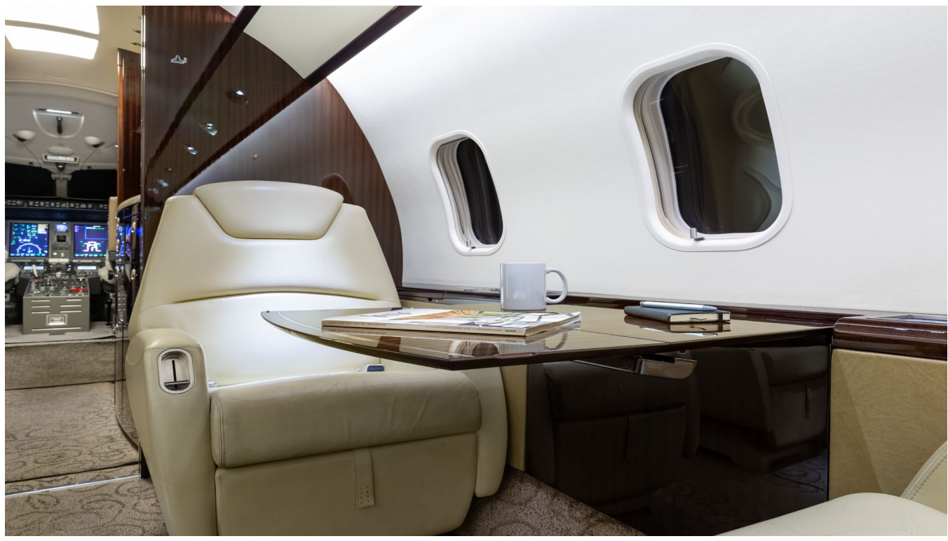
Right-Hand Forward Facing Seat