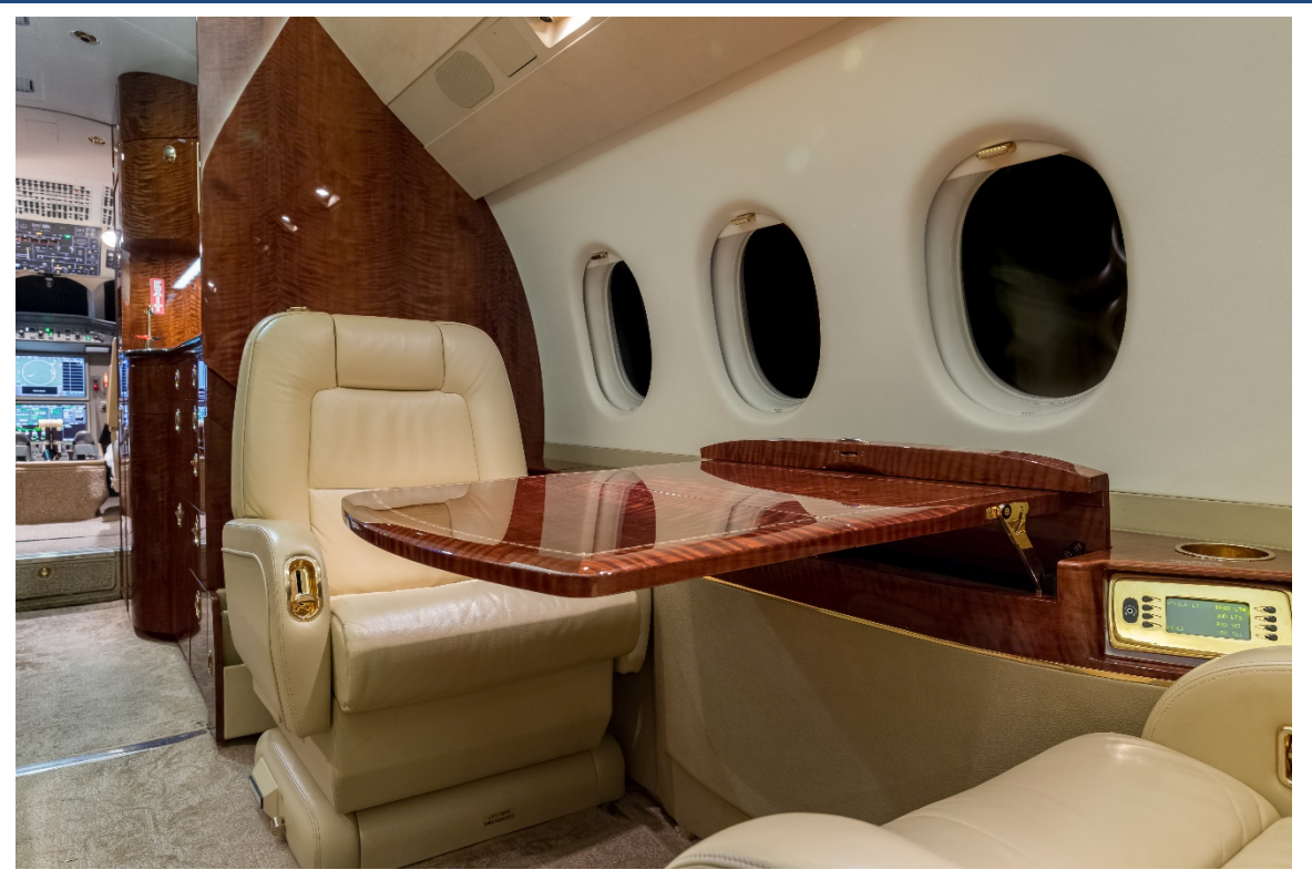
Right side VIP Seat facing Forward