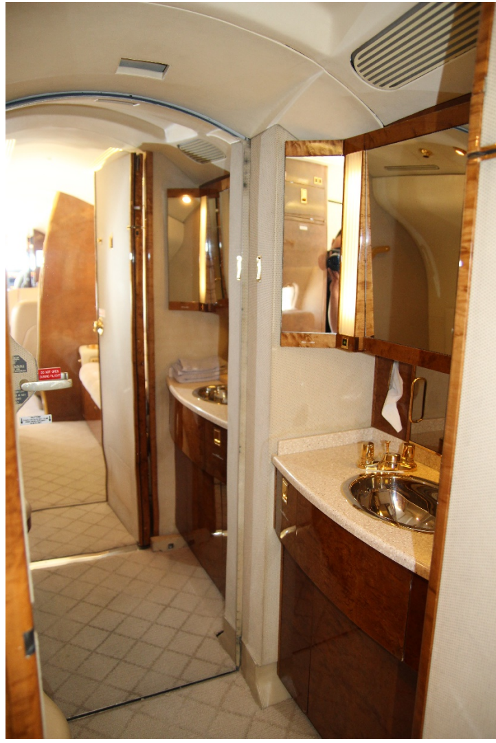
Forward Galley Looking Aft