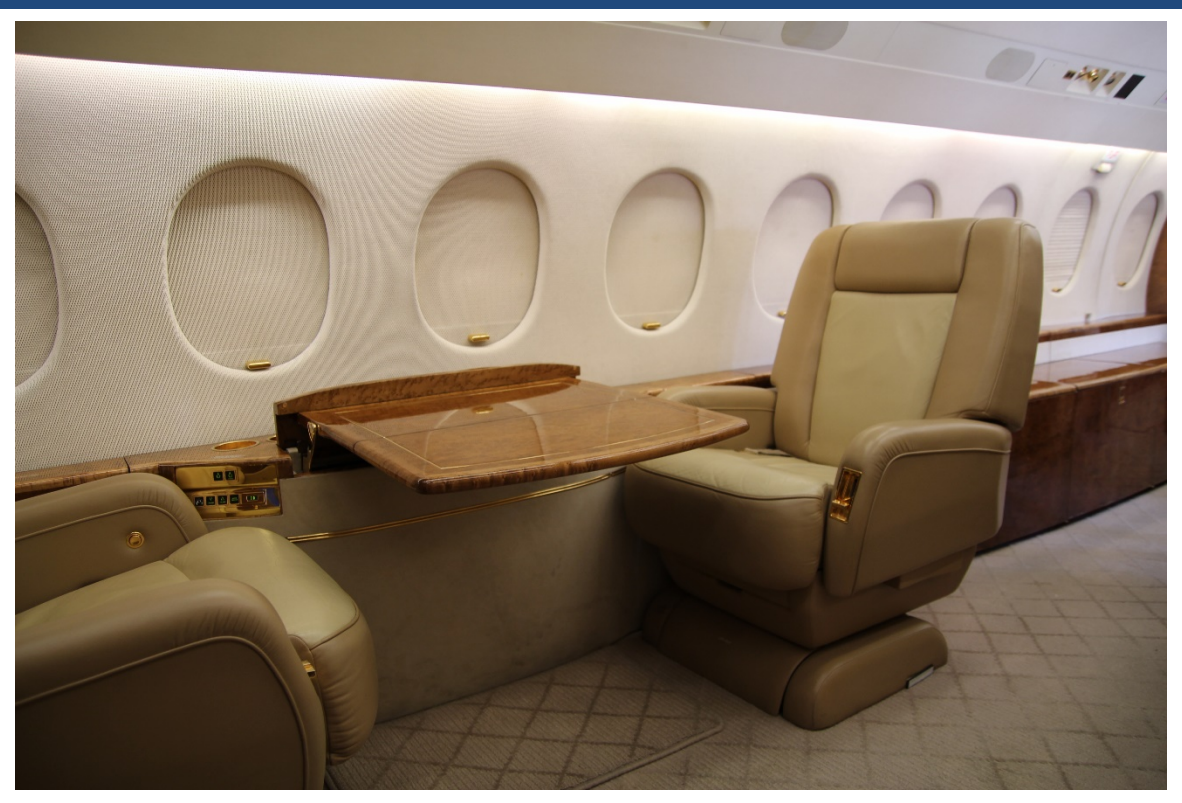
VIP Seat Facing Forward