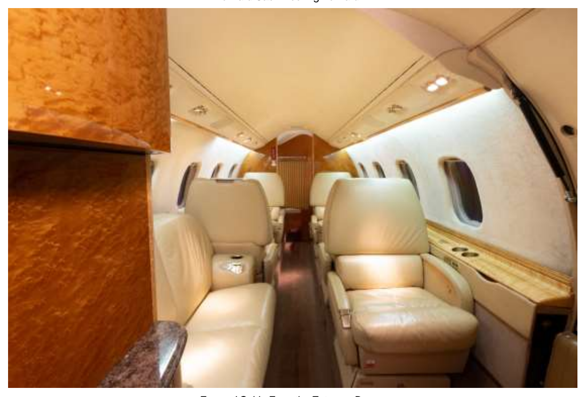
Forward Cabin From the Entrance Door