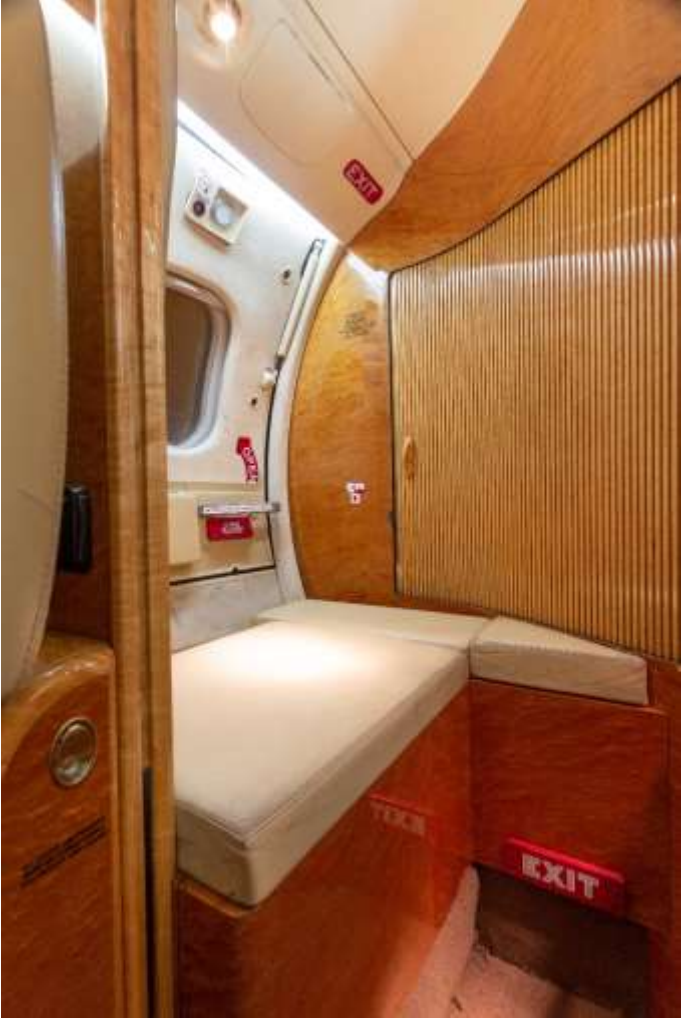
Forward Refreshment Center