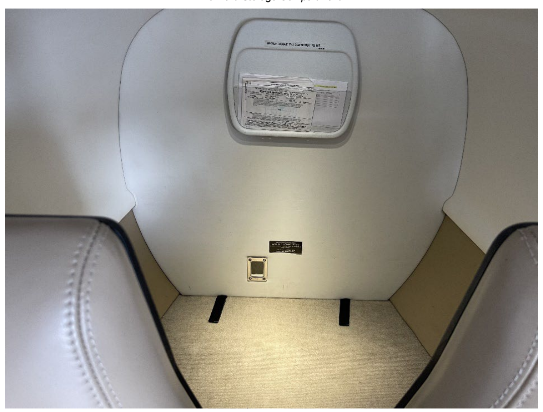
Aft Baggage Compartment