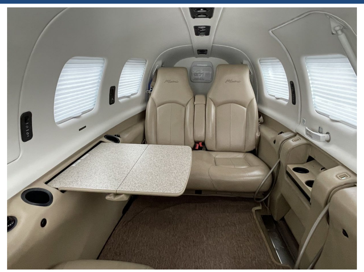
Cabin looking Aft