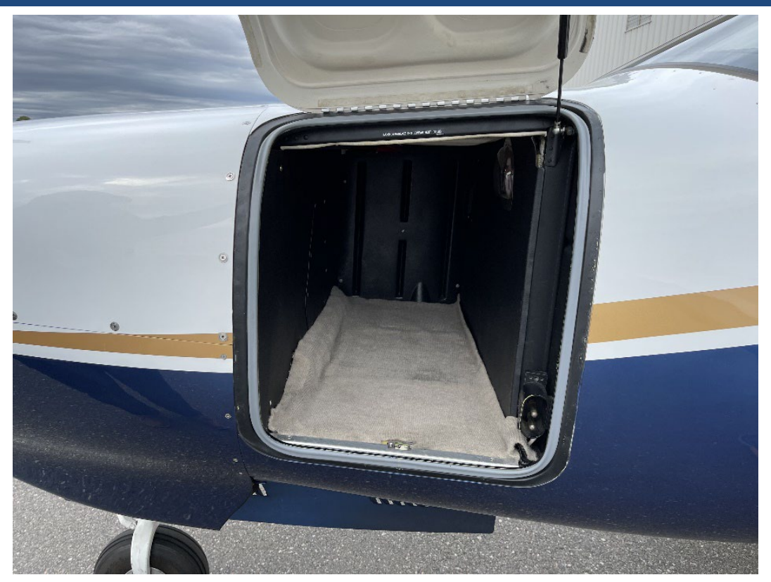
Forward Storage Compartment