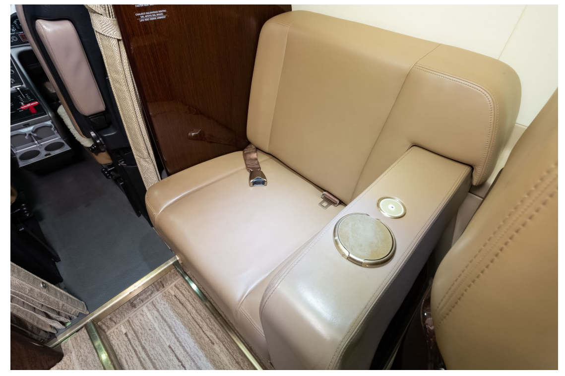
Forward Side Facing Single Divan