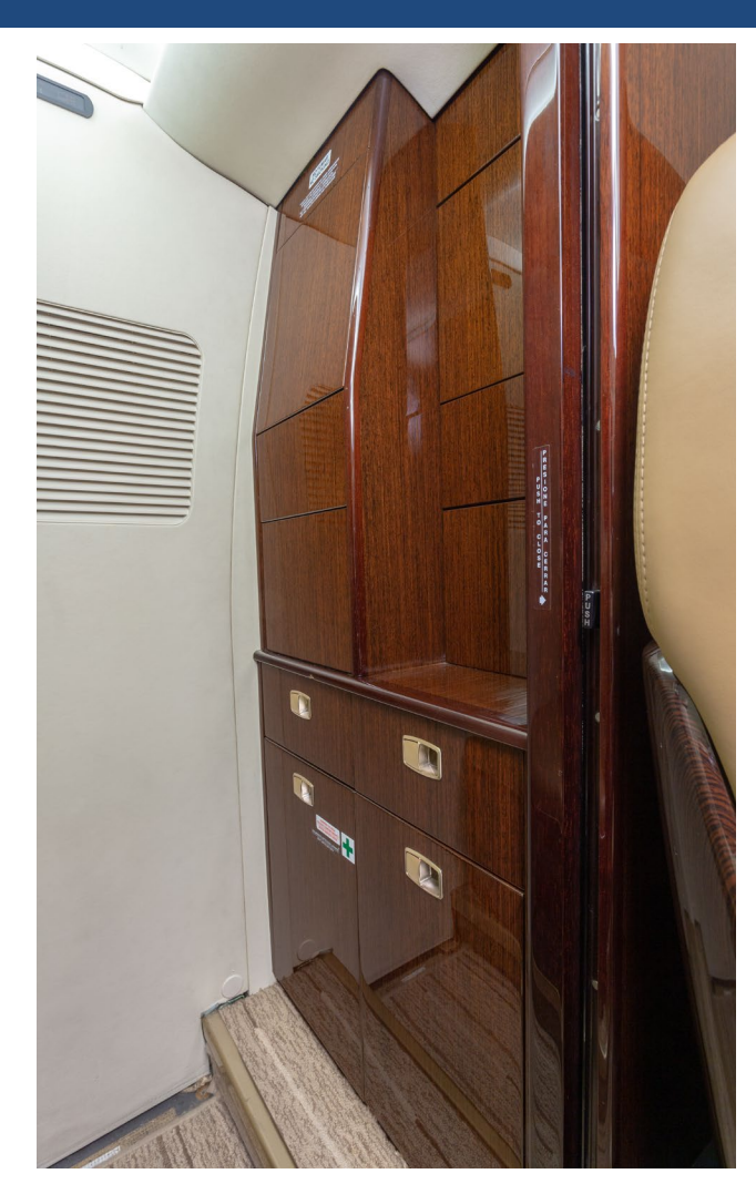
Refreshment Center in the Lavatory