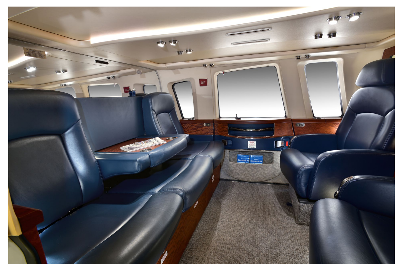
5 Seats Configuration