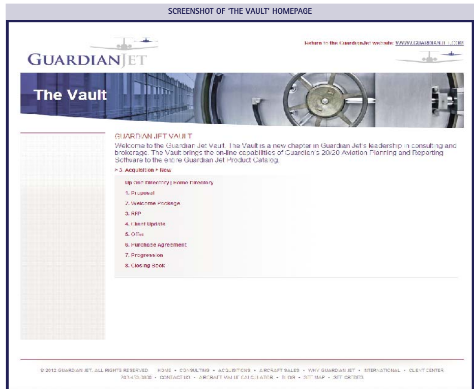
SCREENSHOT OF 'THE VAULT' HOMEPAGE

➤ More information from www.guardianjet.com