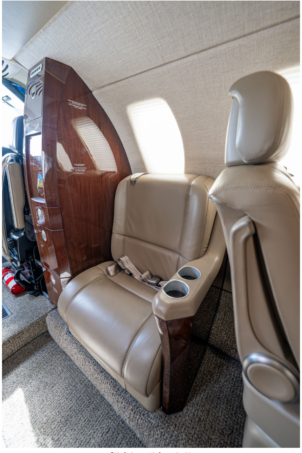
Side-facing seat in forward cabin