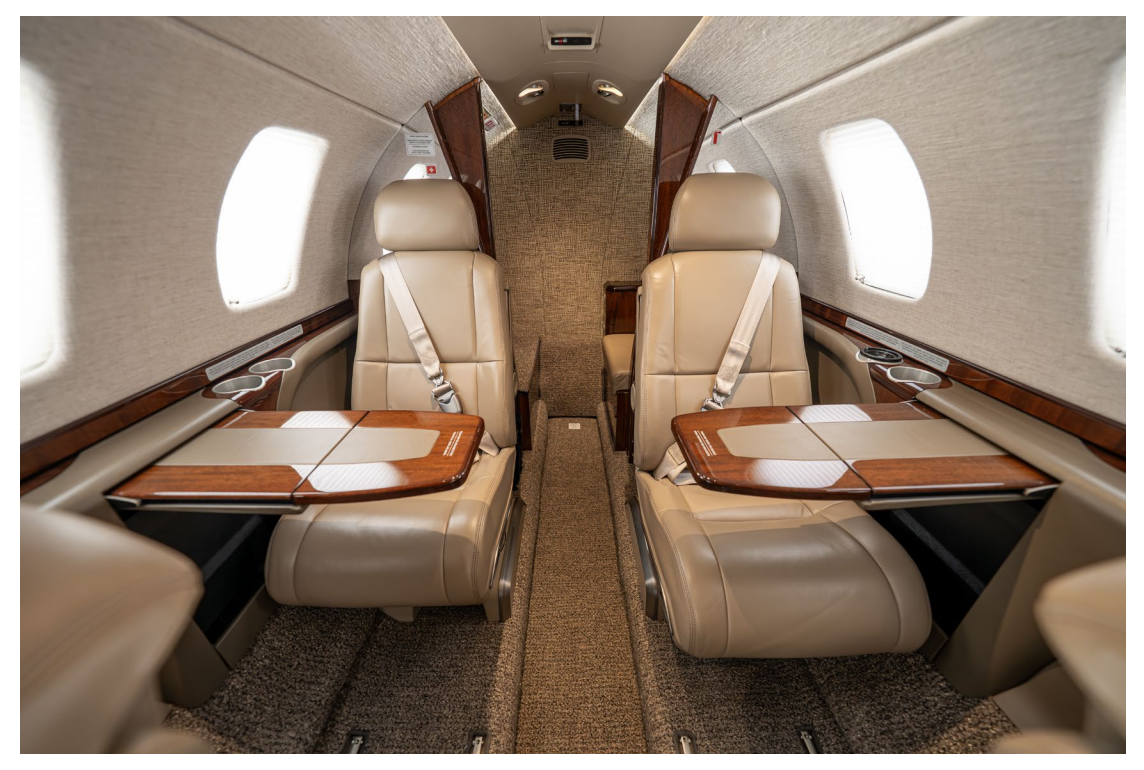
Mid cabin looking aft