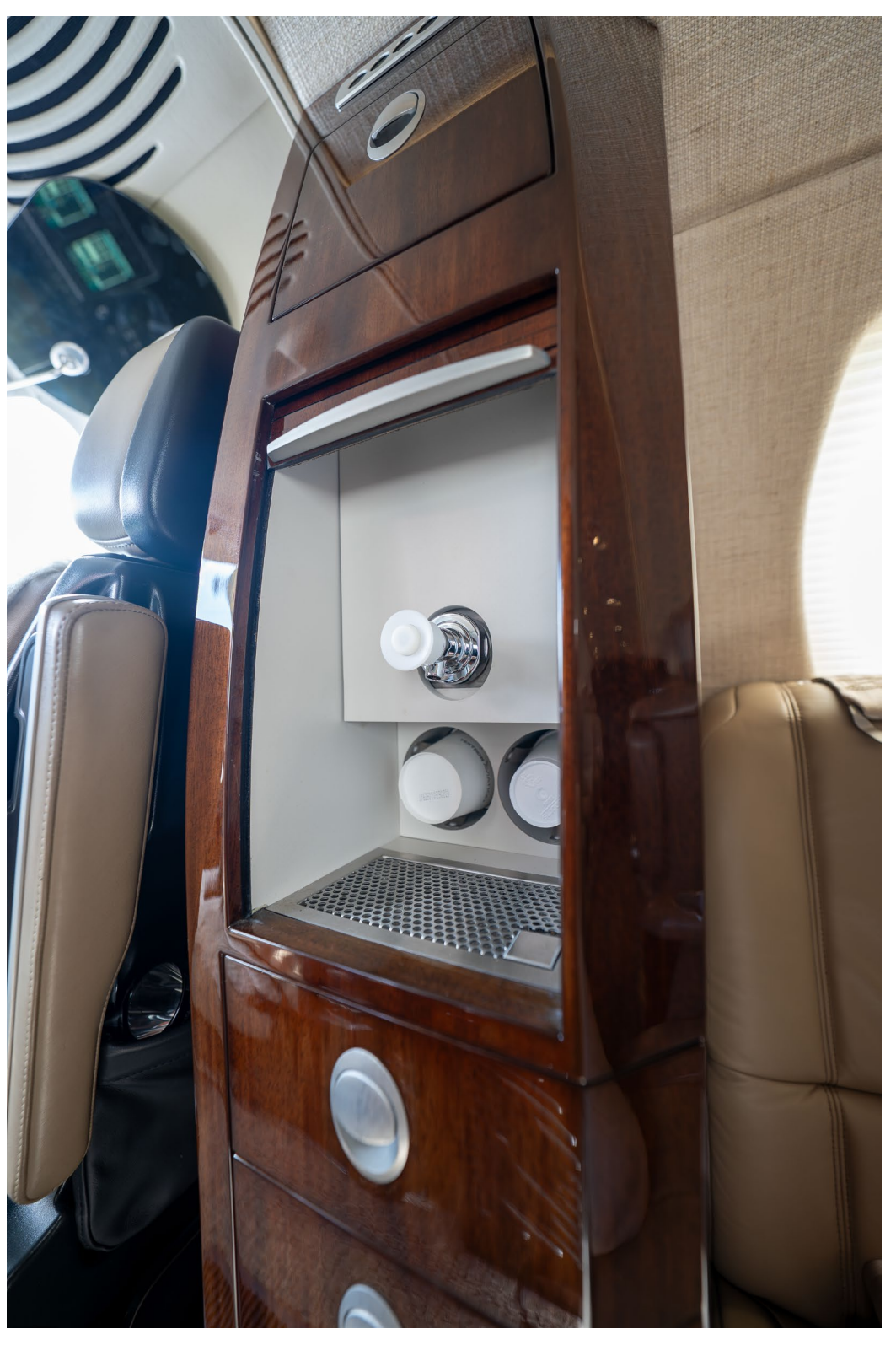
Refreshment center in forward cabin