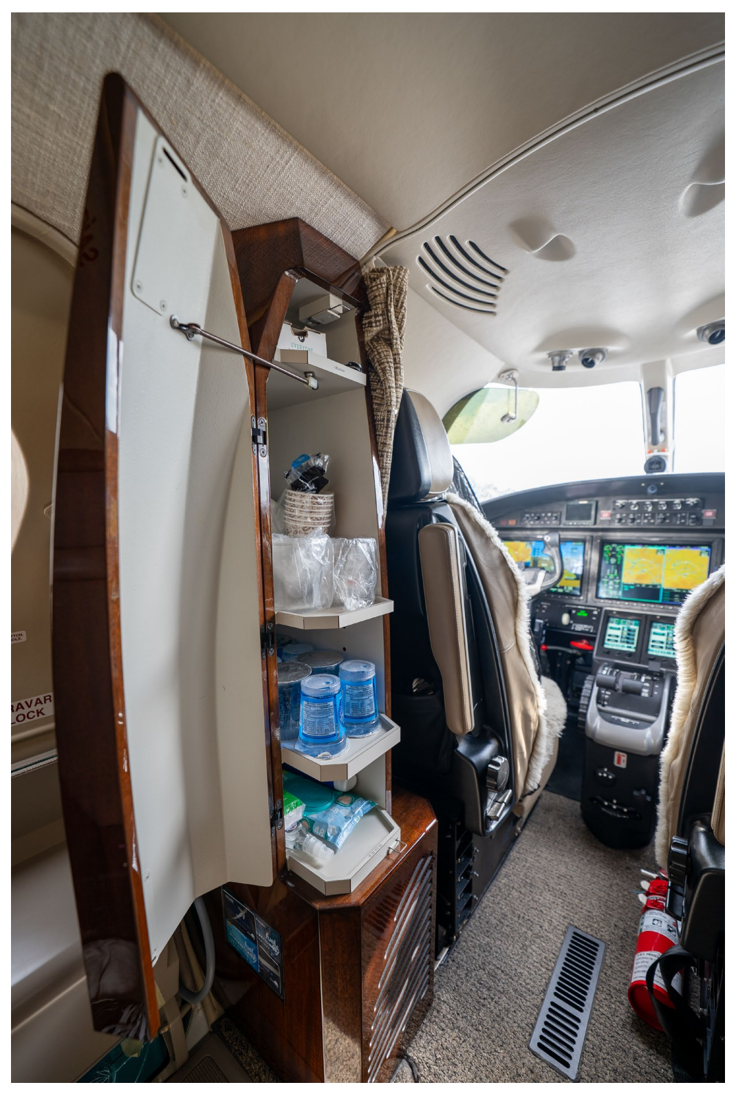
Storage cabinet in forward cabin