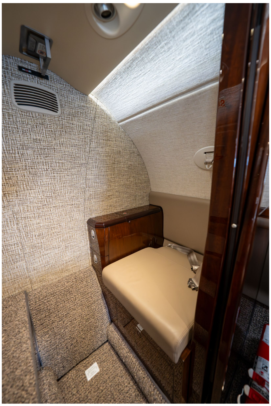
Belted lav in aft cabin