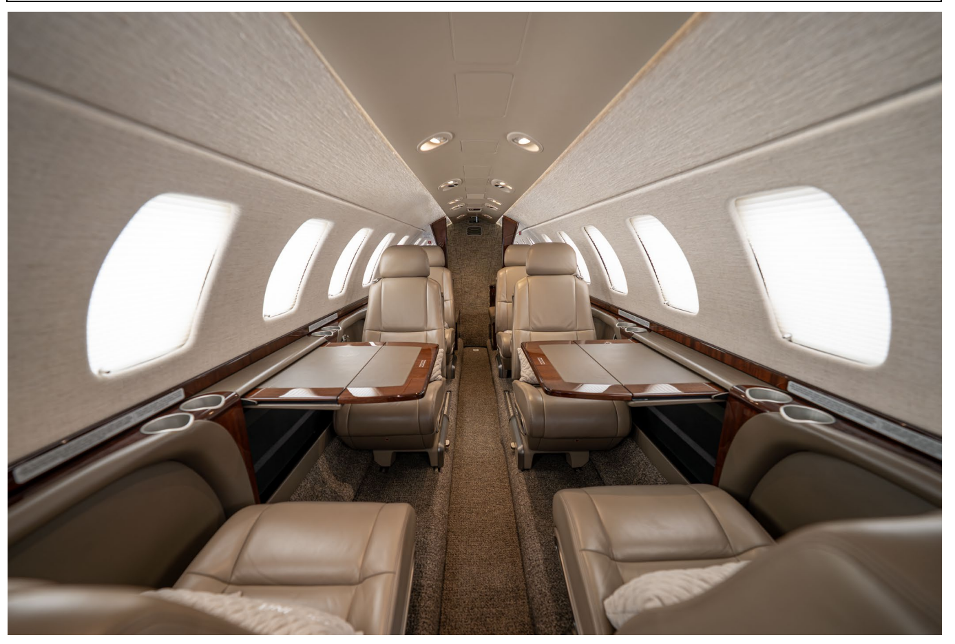
Forward cabin looking aft

A sophisticated 7-passenger + belted lav configuration featuring a forward refreshment center, a forward side-facing seat, a four-place club with swivel capabilities and foldout executive tables, and two forward-facing seats in the aft cabin with swivel capabilities and foldout tables