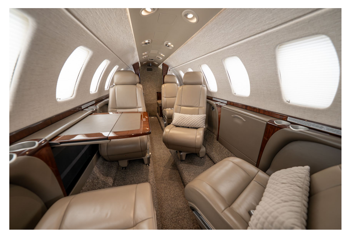
Forward cabin looking aft (passenger seats with swivel)