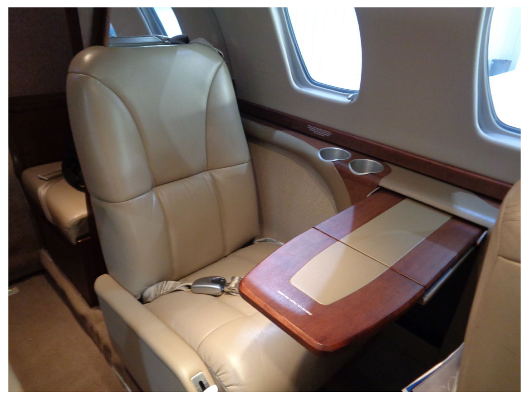
Aft Seat looking Forward