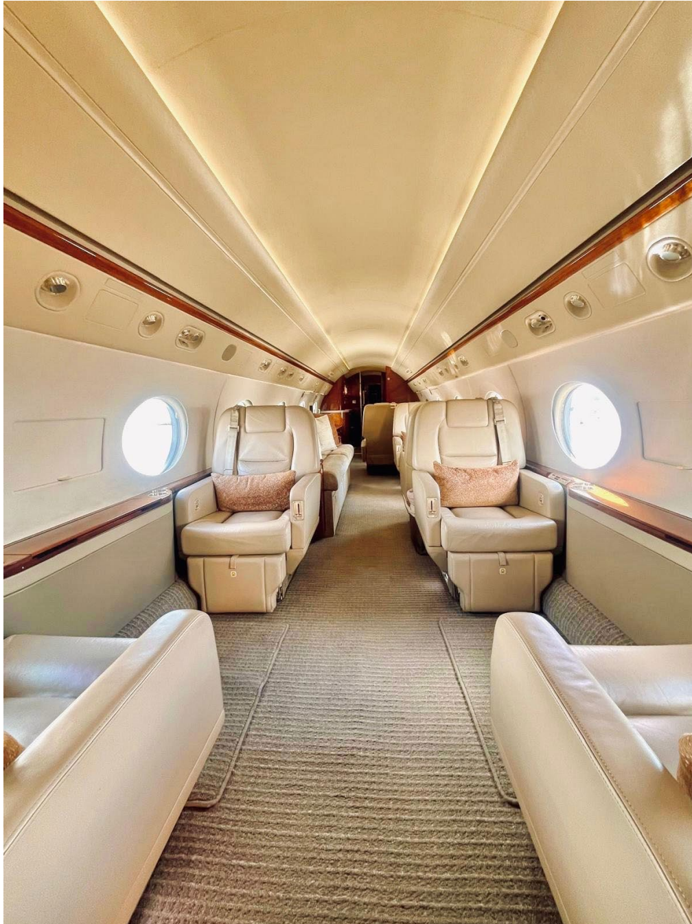
Forward-Cabin Looking Aft

This 14-passenger configuration features an aft galley and a forward crew lavatory. The cabin includes a forward four-place club, mid four-place divan opposite two-single club seats, and a four-place conference group opposite a credenza. Aft galley including microwave, hi-temp oven, and two TIA coffee makers