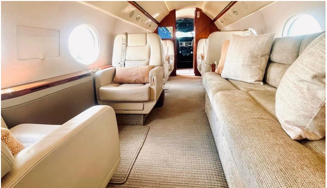
Mid-Cabin Looking Forward