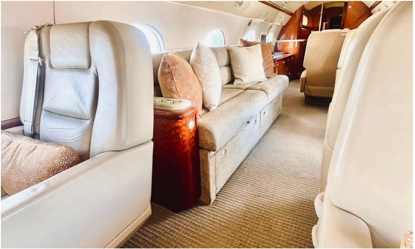
Forward-Cabin Looking AFT