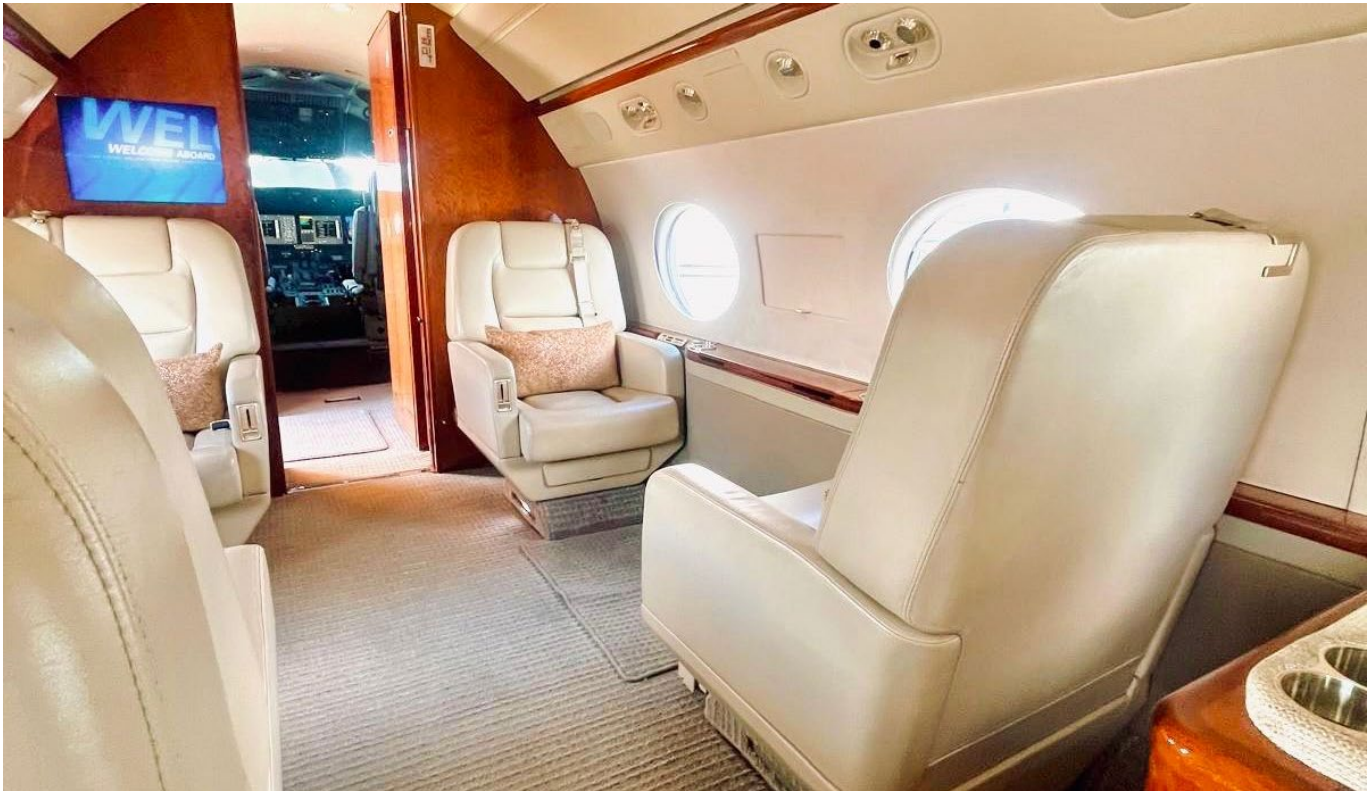
Mid-Cabin Looking Forward