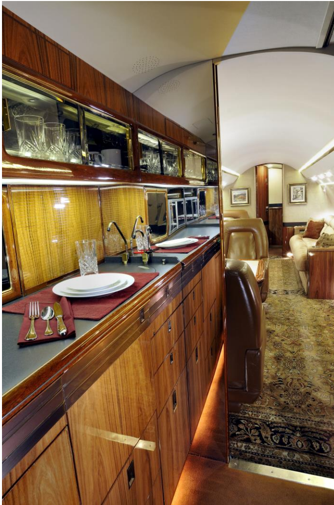
Forward Galley looking aft