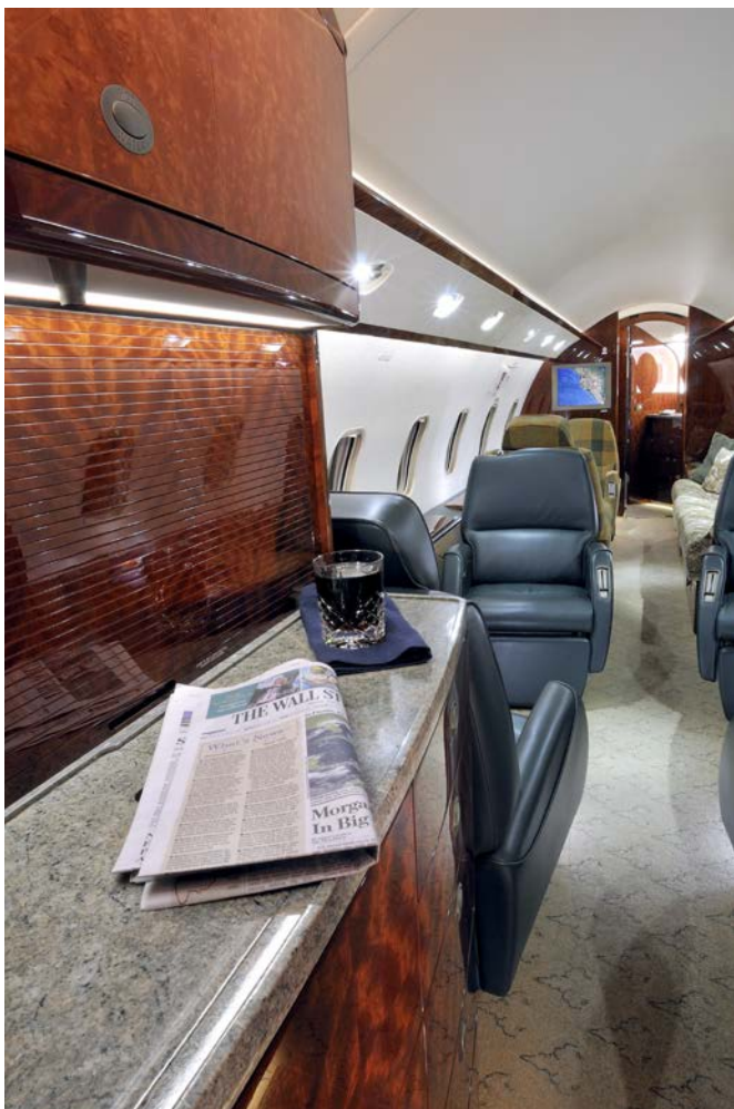
Fwd Galley looking Aft