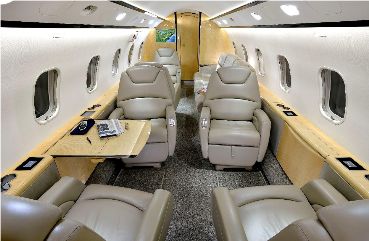
Forward Cabin looking Aft

This contemporary nine passenger configuration (ten passengers with belted toilet) features forward cabin 4-place club seating with a 3-place divan in the aft cabin across from a right hand 2-place club. The natural stain sycamore has a hi-gloss clear finish and is accented with black carbon fiber and brushed silver fixtures. The premium carpet is tan with a scalloped pattern and soft high density loop. Tan leather reclining seats and a cream silk headliner complete the theme. The aircraft is equipped with an aft lavatory and a forward galley, both featuring sycamore cabinetry and black carbon fiber countertops. With only one owner since new, the interior has been meticulously maintained and still shows like new.