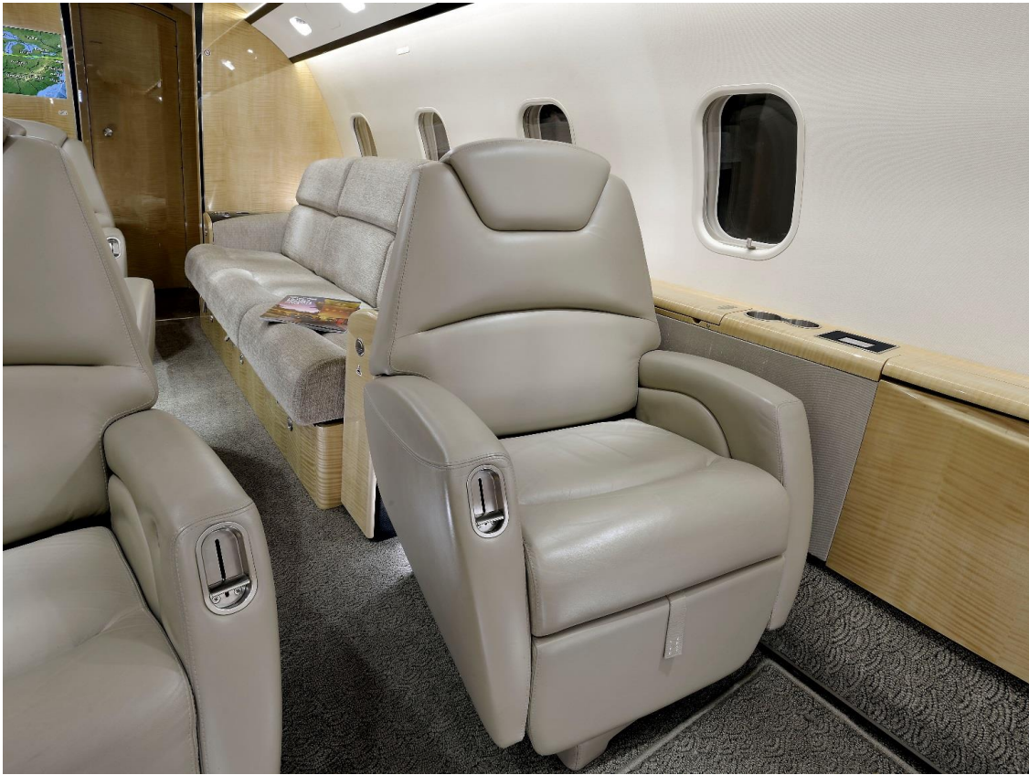
Left-Hand Forward Facing Seat