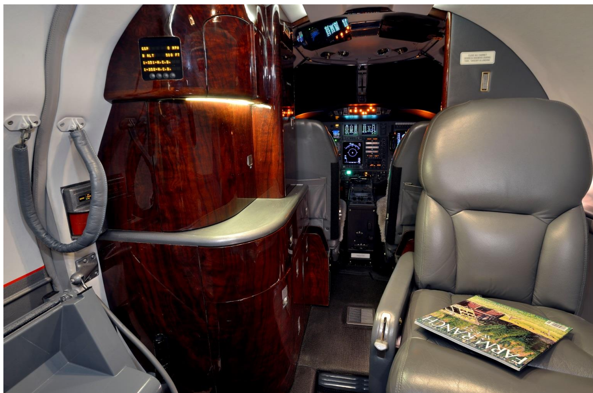
Forward Right Hand Single Seat Facing Aft