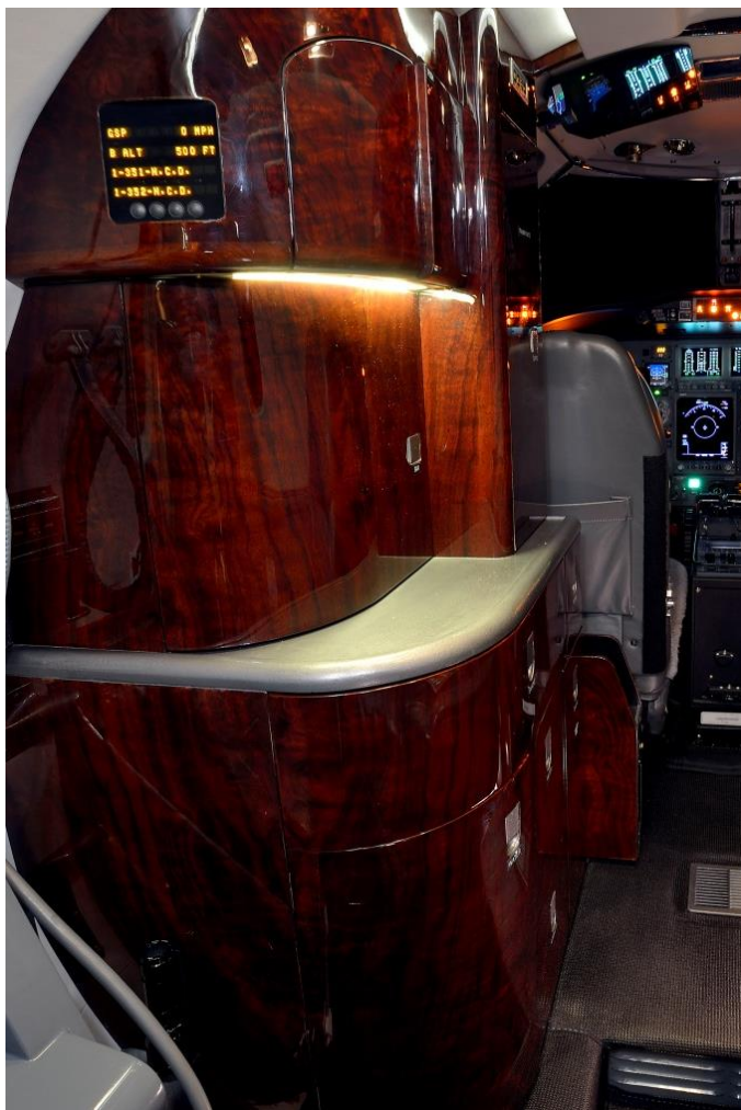
Left Hand Refreshment Center