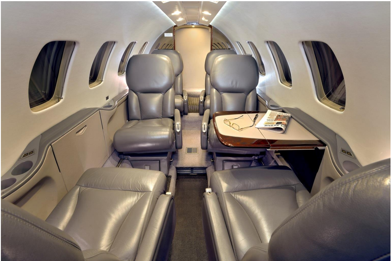
Forward Cabin Looking Aft (Lavatory Door Open)

This beautiful 8 passenger executive interior features seven main cabin leather seats and a belted toilet with forward left side galley. There are two 110v AC outlets in the cabin and two in the cockpit.