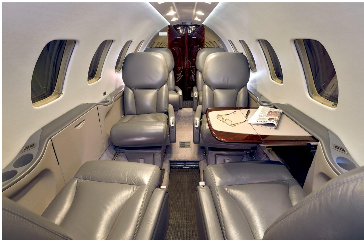
Forward Cabin Looking Aft (Lavatory Door Closed)