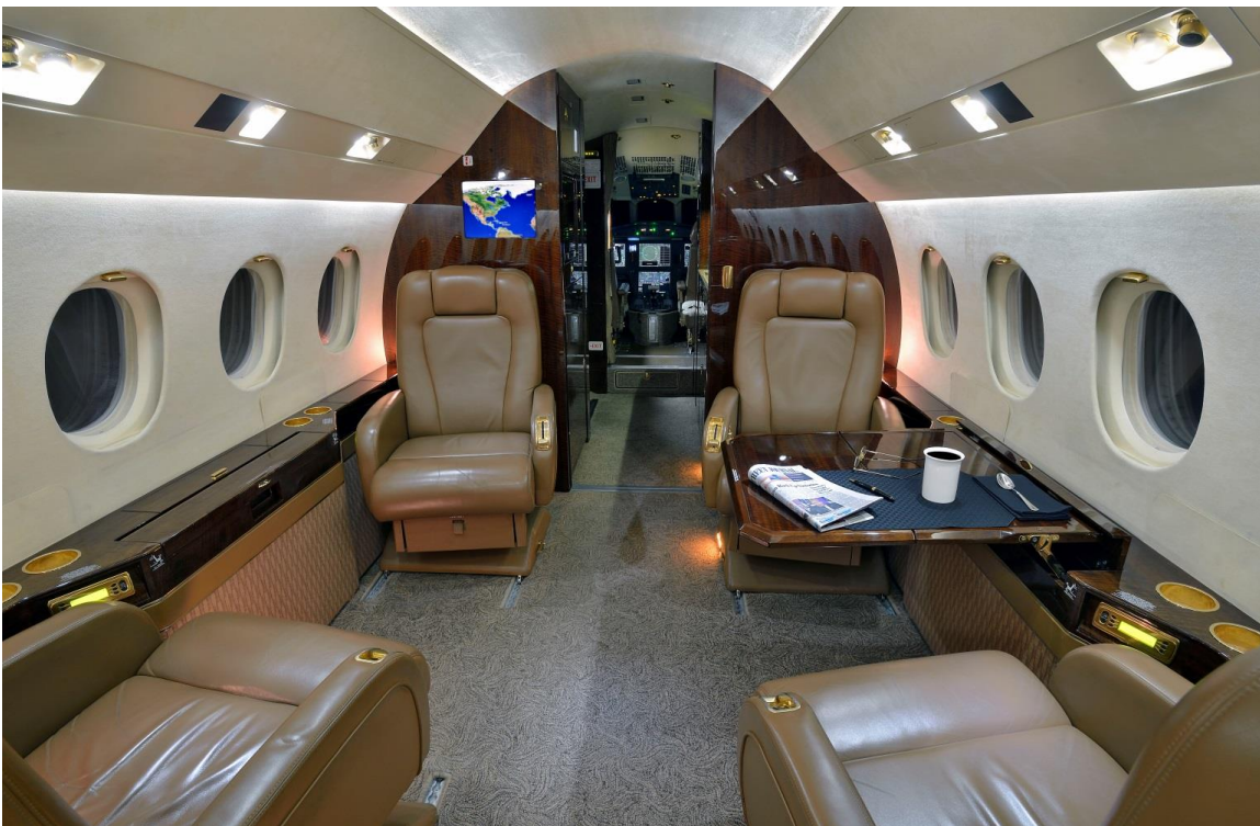
Mid-Cabin looking Forward