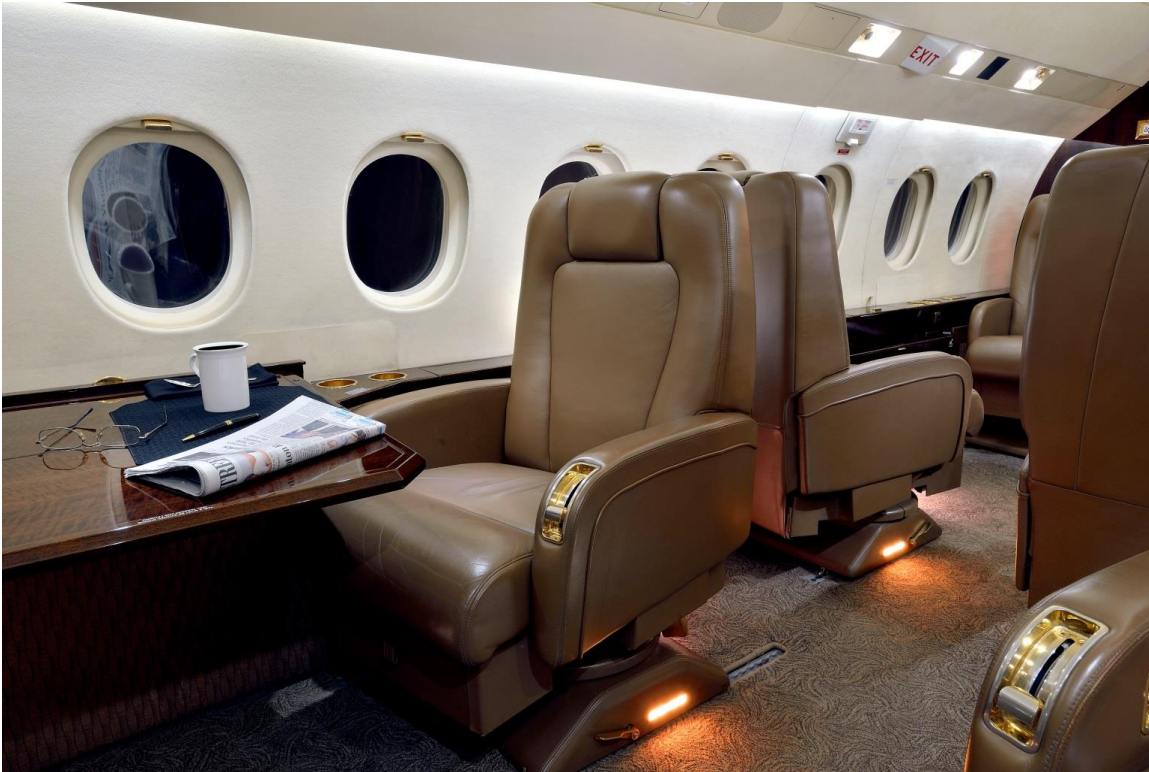
Right side VIP Seat facing Forward