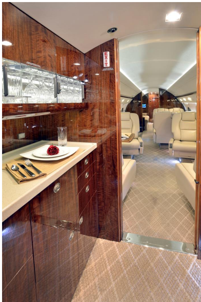
Forward Galley looking Aft