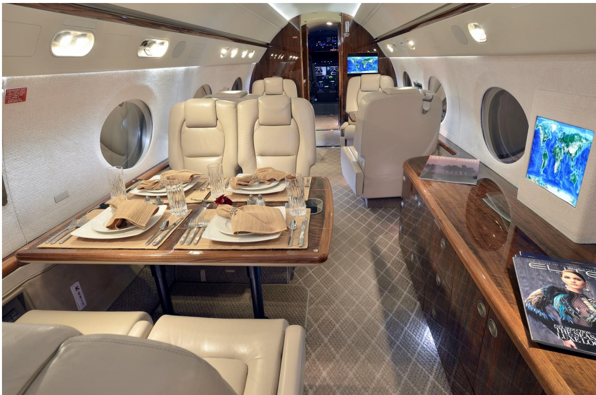
Mid-Cabin Looking Forward