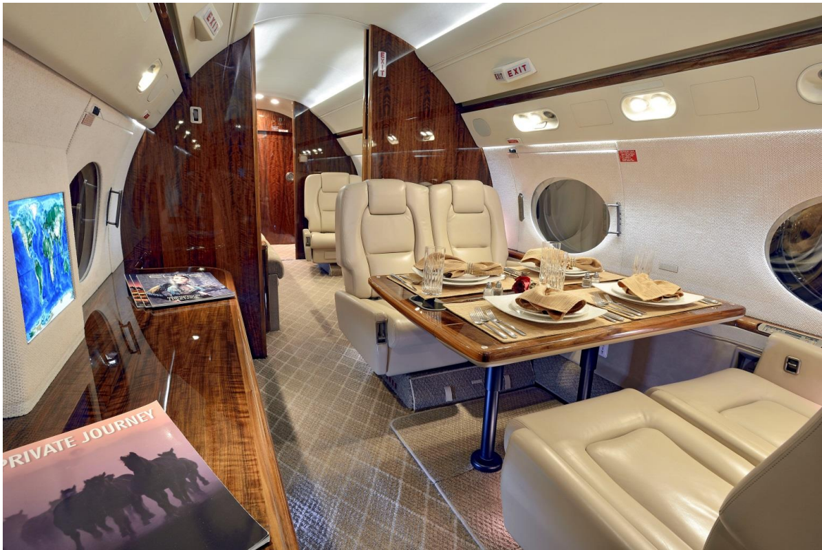
Mid-Cabin Looking Aft