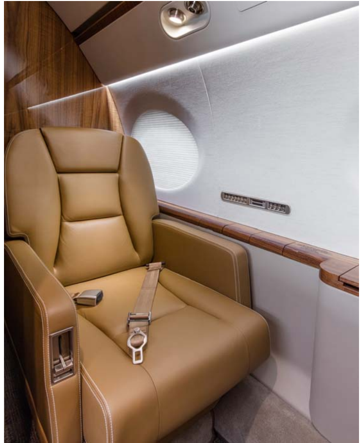
Forward Crew Rest