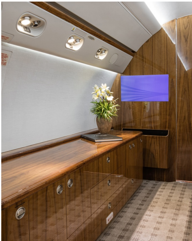
Right Side Aft Credenza