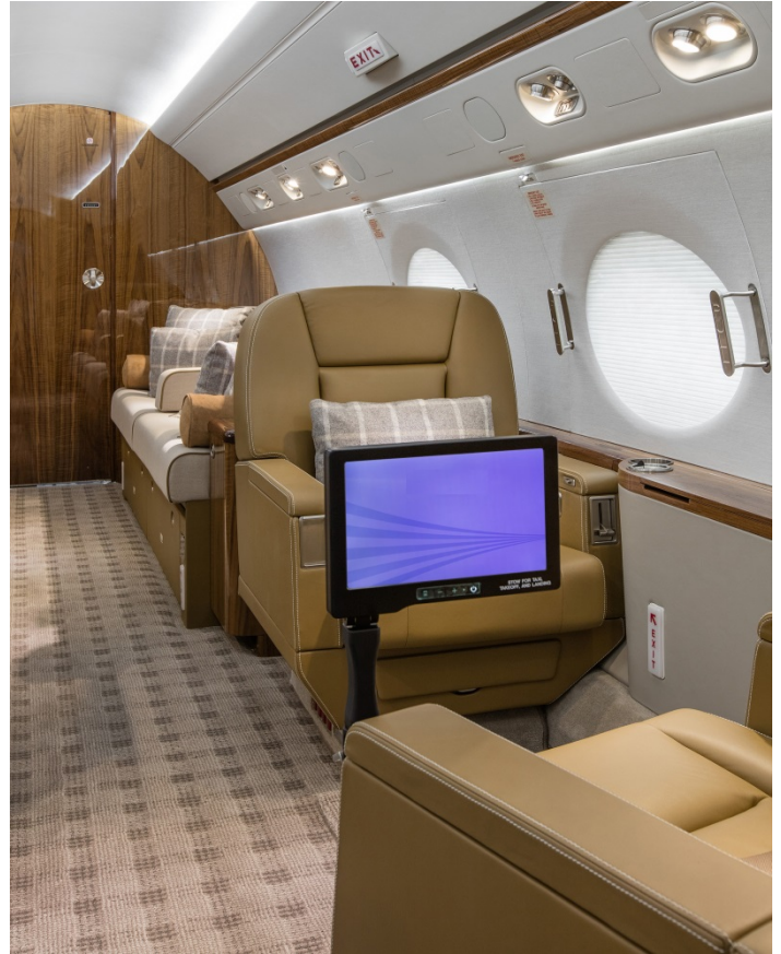
Left Side Mid-Cabin Looking Aft