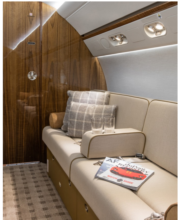
Left Side Aft Divan