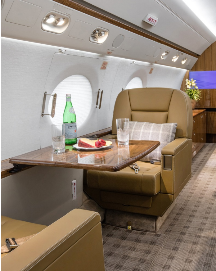
Right Side Mid-Cabin Looking Aft