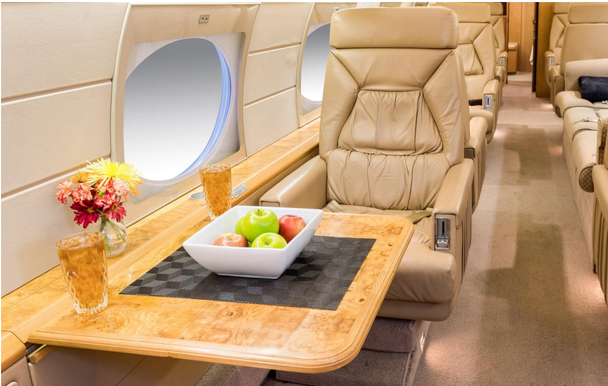
Right Hand VIP Seat Facing Forward