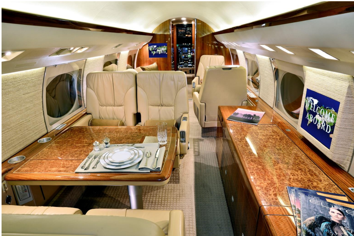
Mid Cabin looking Forward