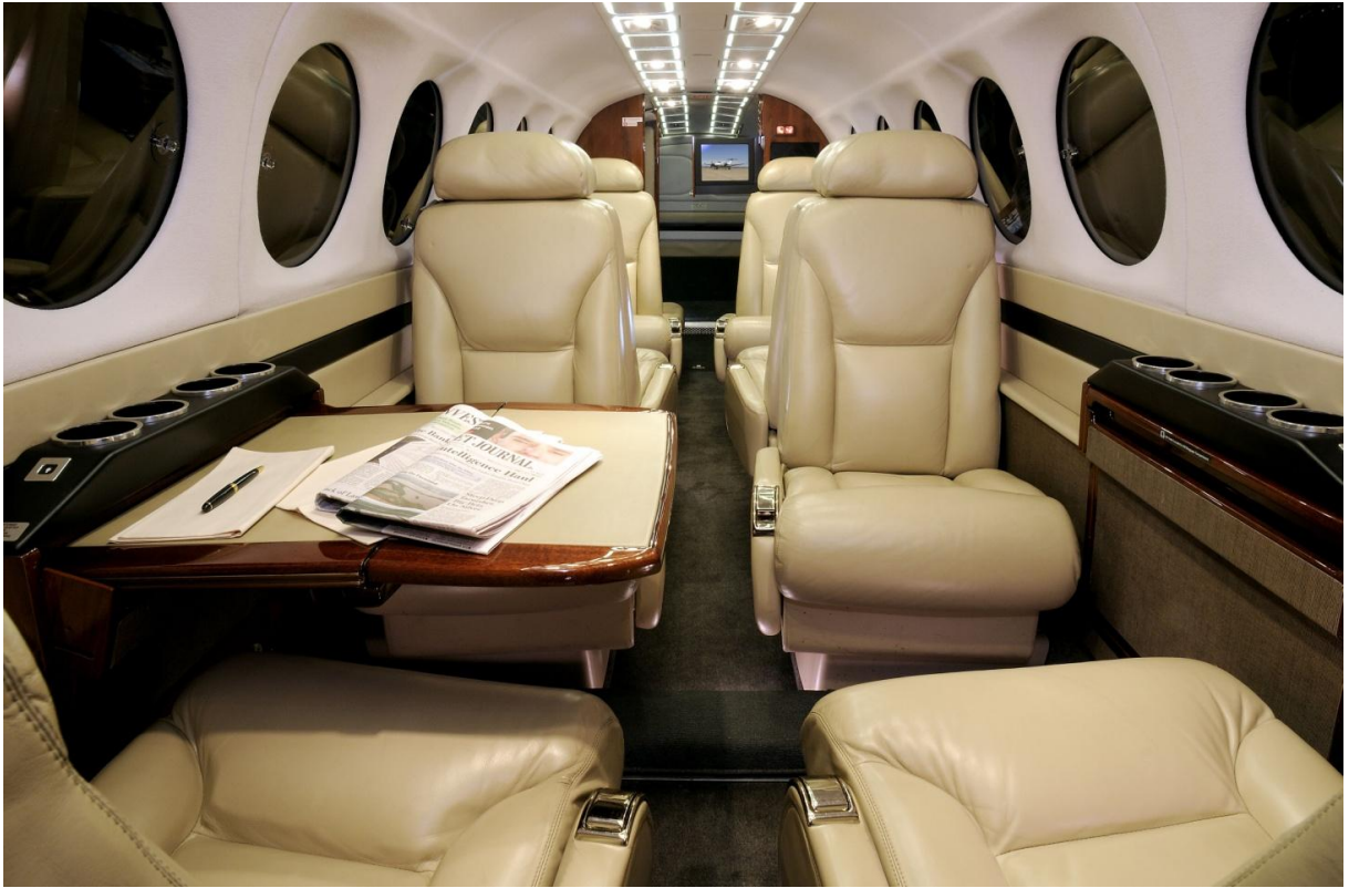
These photographs depict the monitors in use.