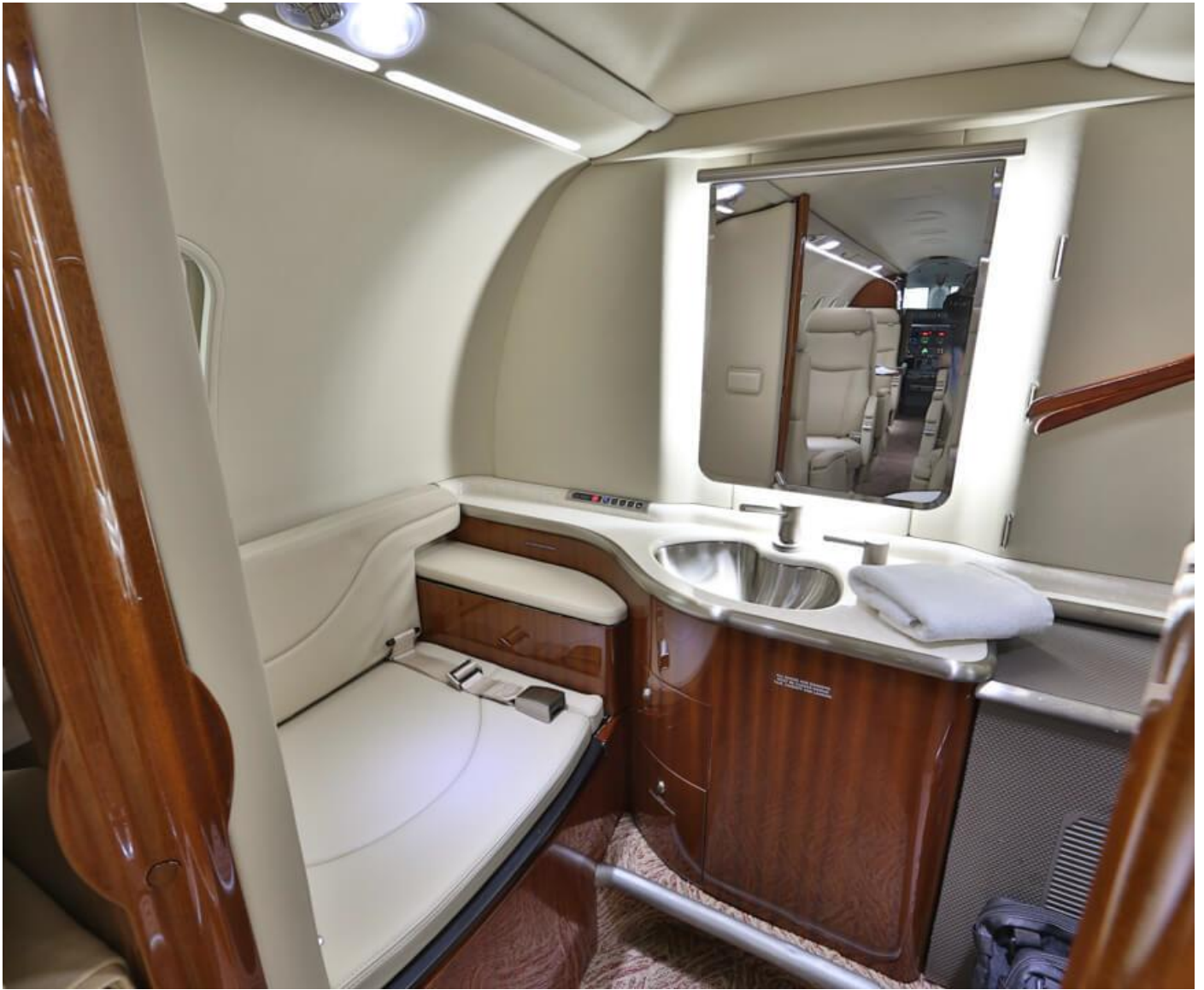
Aft Belted Lav