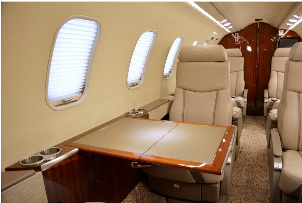
Forward Right Hand VIP Seat with Table Revealed