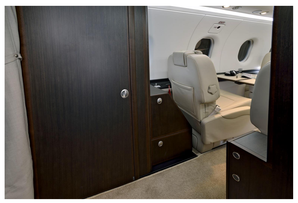
Forward Refreshment Center