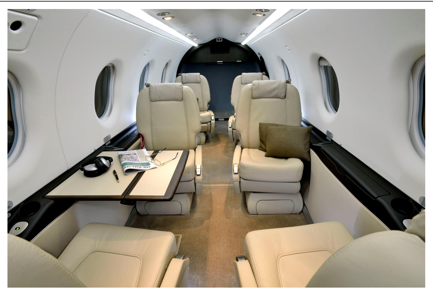
Fwd Cabin looking Aft

The cabinetry, bulkheads and table tops are Warm Ebony Echowood, the upper cabin panels are Fusion Classic Grey and the seats and lower sidewalls are Volaro Athens.