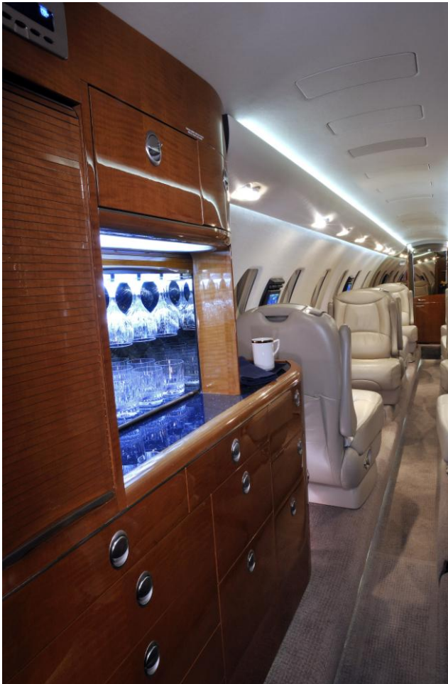
Forward Galley looking aft