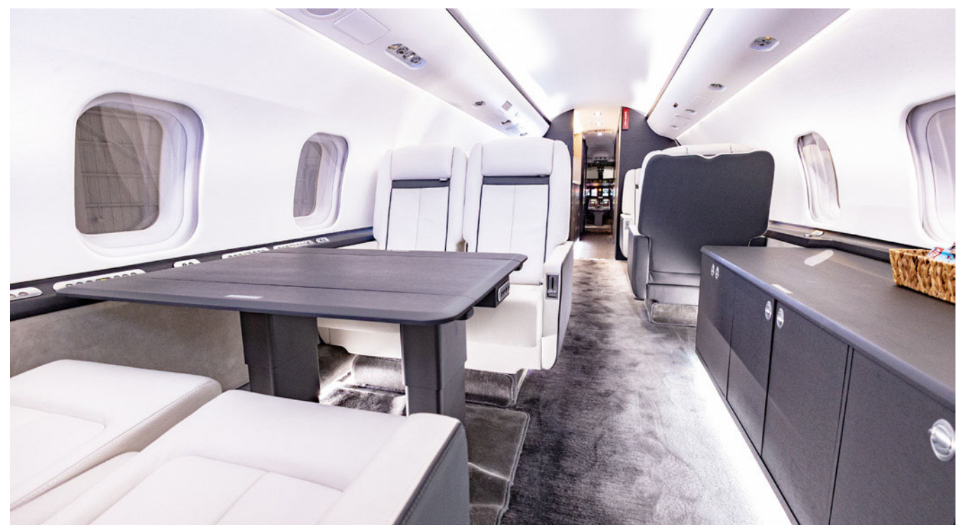
Right Hand Seat Facing Forward