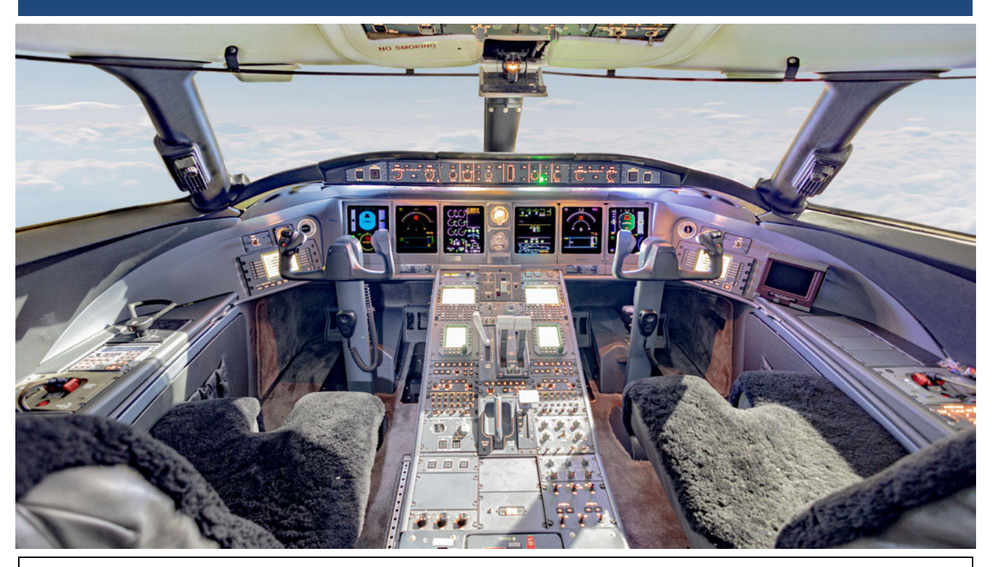
AVIONICS: Honeywell Primus 2000 XP Avionics Suite

AIR DATA COMPUTERS: Triple Honeywell AZ-840 Micro Air Data Computers CONTROL DISPLAY UNITS: Dual Honeywell FMS CDU 820 Control Display Units COCKPIT VOICE RECORDER: Single Allied Signal COMMUNICATIONS: Dual Honeywell RNZ-851 ELECTRONIC FLIGHT INSTRUMENT SYSTEM: 6 Tube Honeywell DU-870 8' x 7' units EMERGENCY LOCATOR TRANSMITTER: Single Airtex 406 ELT w/ Nav FLIGHT DATA RECORDER: Single Allied Signal GLOBAL POSITIONING SYSTEM: Dual Honeywell SBAS/WAAS Capable GNSSU's HIGH FREQUENCY: Dual Honeywell HF-9014 w/ SELCAL LONG RANGE NAVIGATION: Triple Honeywell LASEREF IV NAVIGATION: Triple Honeywell VHF RADIO ALTIMETERS: Dual Rockwell Collins ALT-4000 TERRAIN AWARENESS AND WARNING: Single Honeywell Mark V w/ Windshear Escape Guidance and RAAS TRANSPONDERS: Dual Honeywell Mode S w/ ADSB-Out TRAFFIC COLLISION ALERT AVOIDANCE SYSTEM: Single TCAS II w/ change 7.1 SATCOM: Single Honeywell MCS-6000 WEATHER RADAR: Honeywell Primus 880 Color Radar