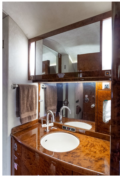
Vanity / Aft Lavatory