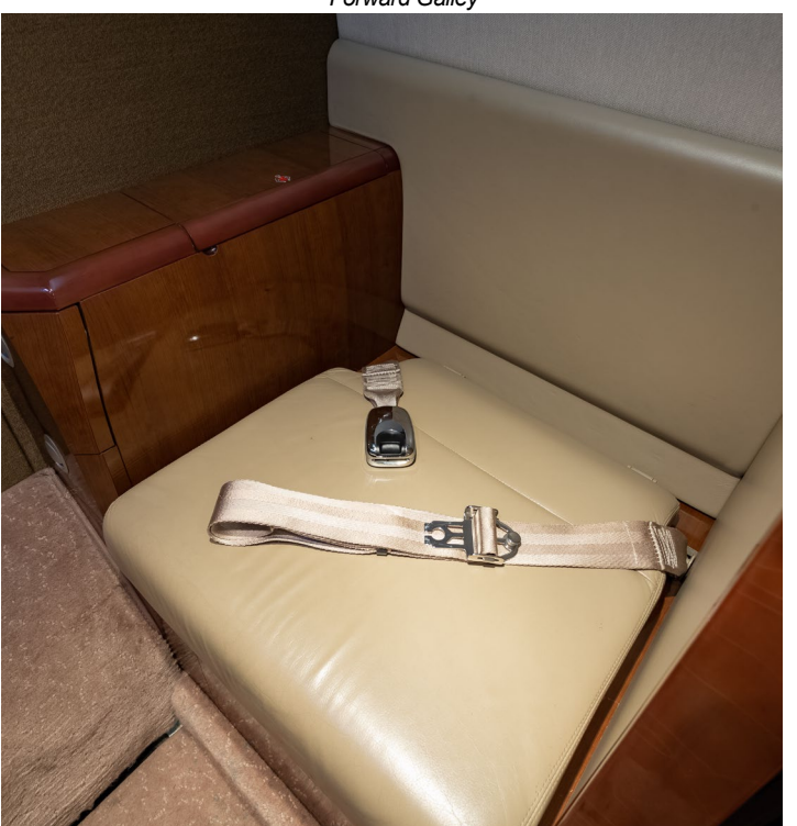
Aft Lavatory with belted toilet