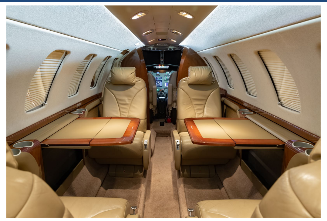
Forward Cabin looking Forward