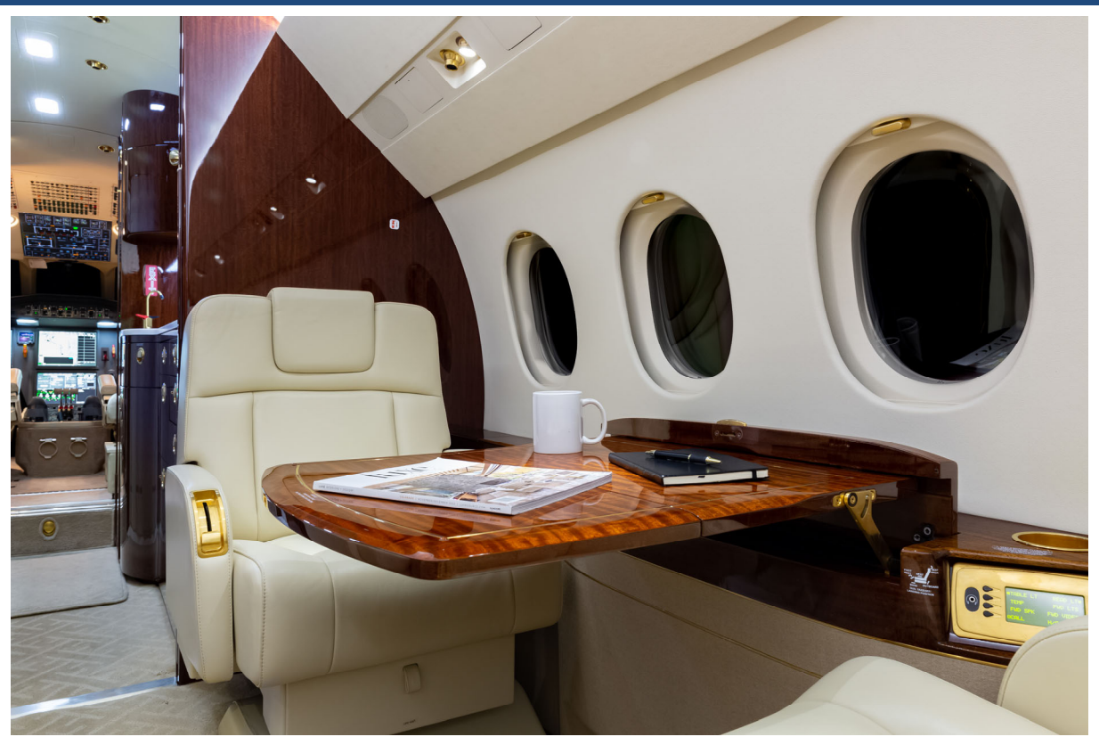
VIP Seat Facing Forward