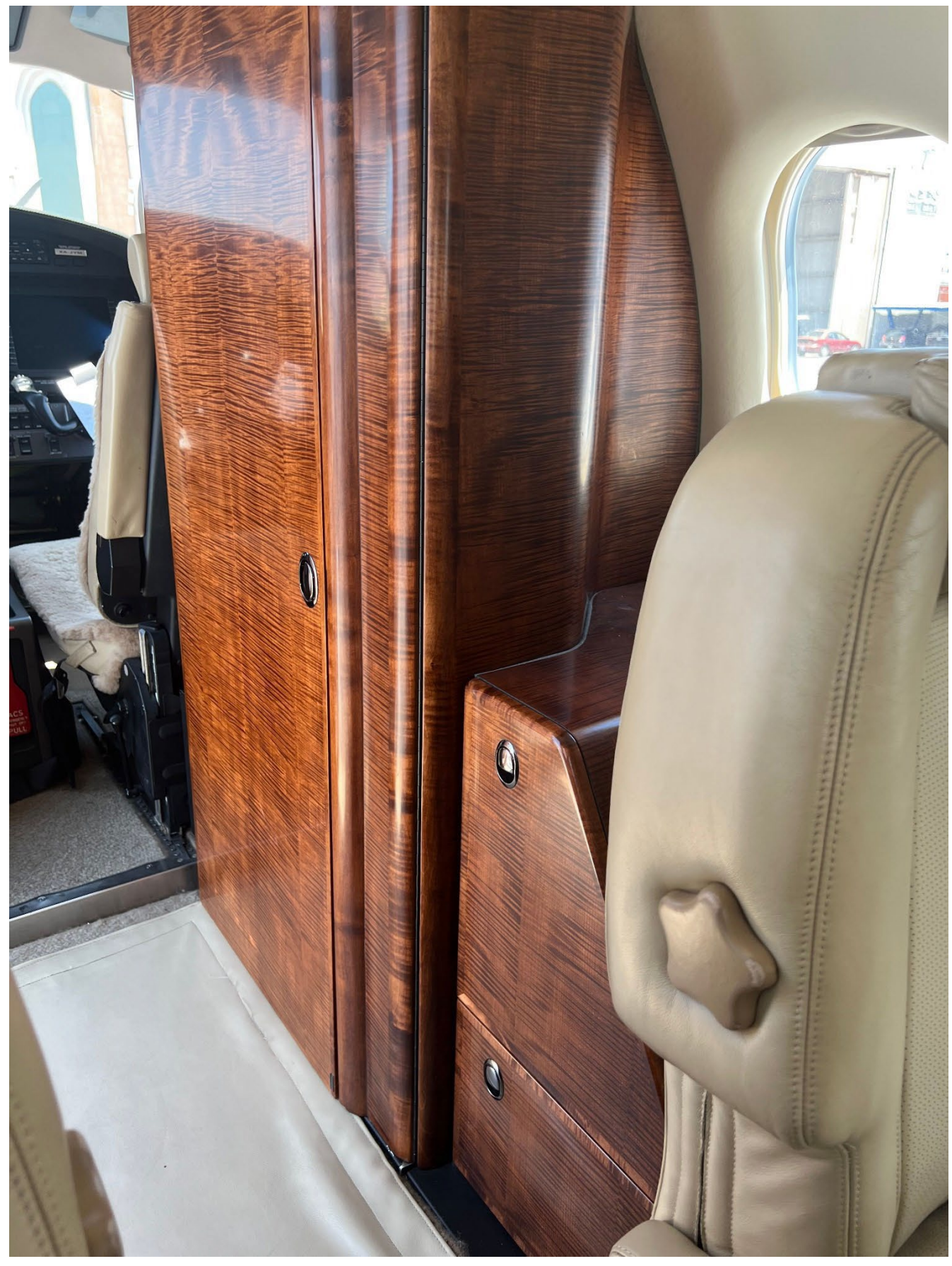
Forward Closet / Lavatory