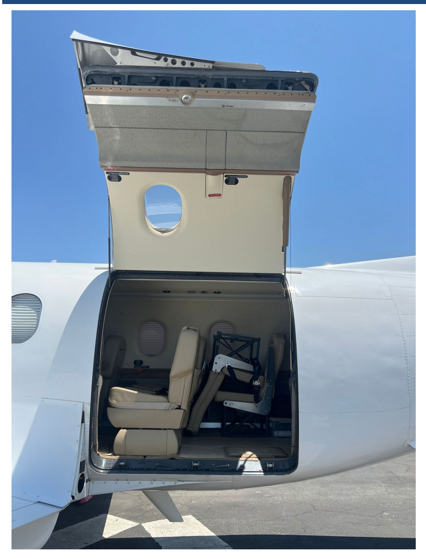
Cargo Door / Baggage Compartment