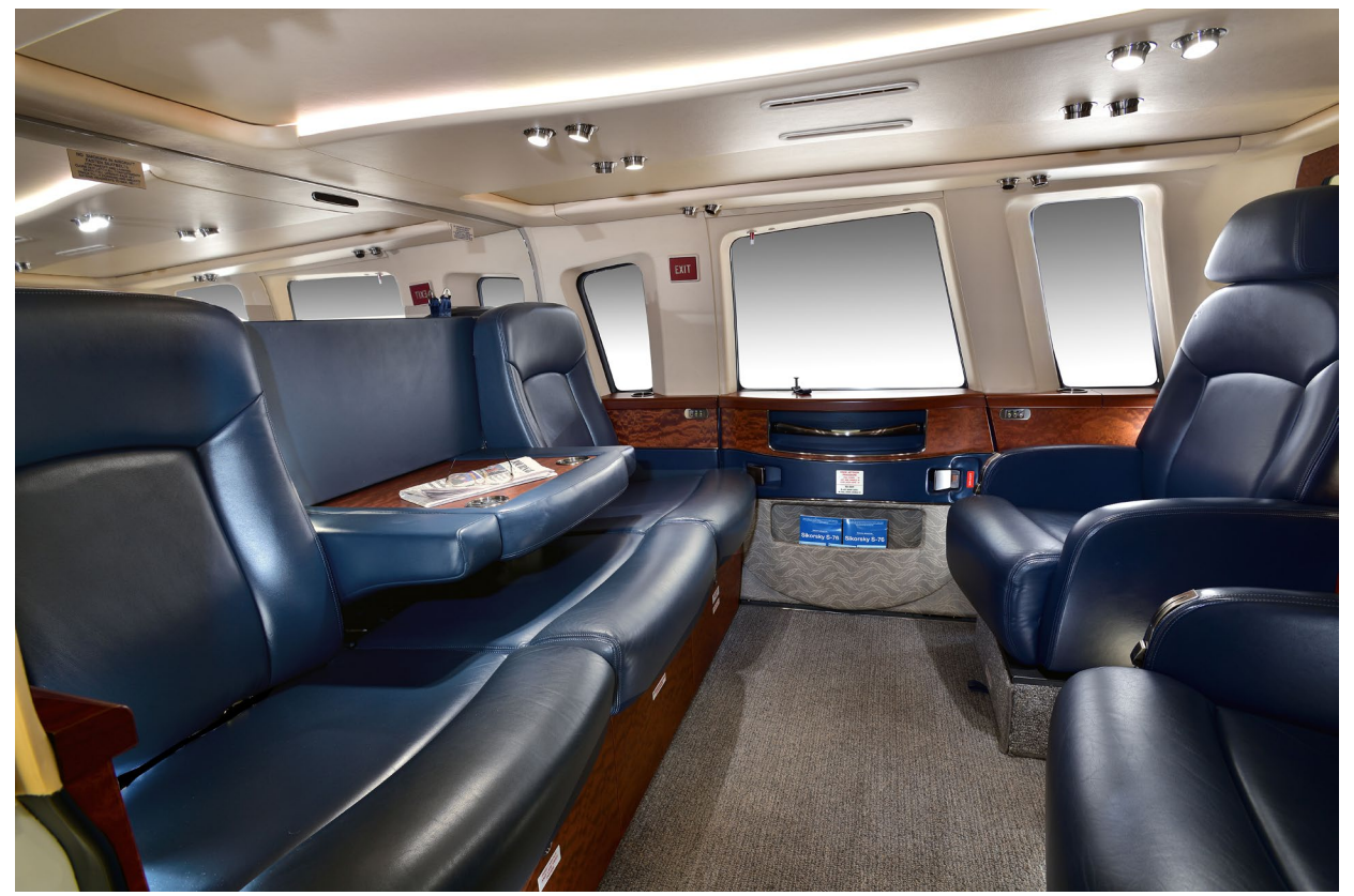
5 Seats Configuration