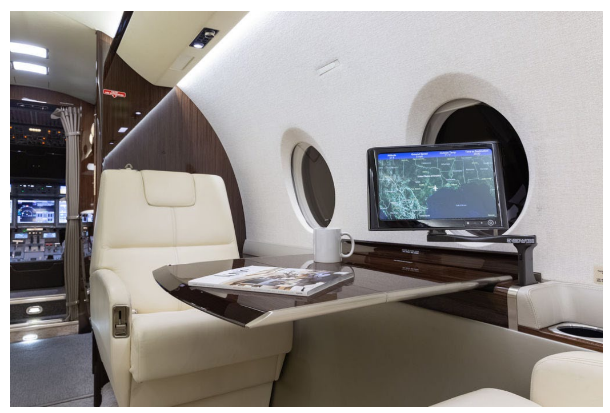
Forward Cabin Seat