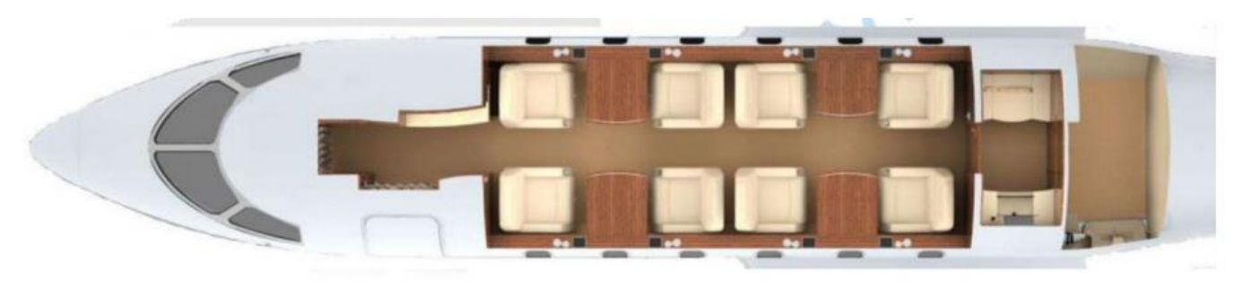
Cabin Floor Plan