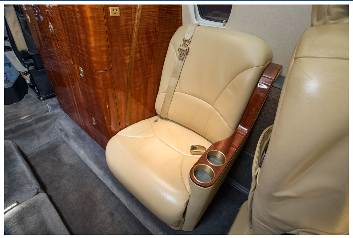
Forward Side Facing Seat