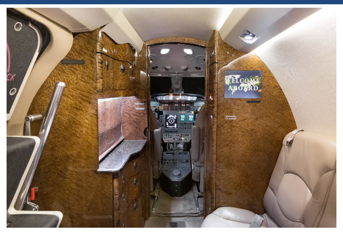
Forward Refreshment Center