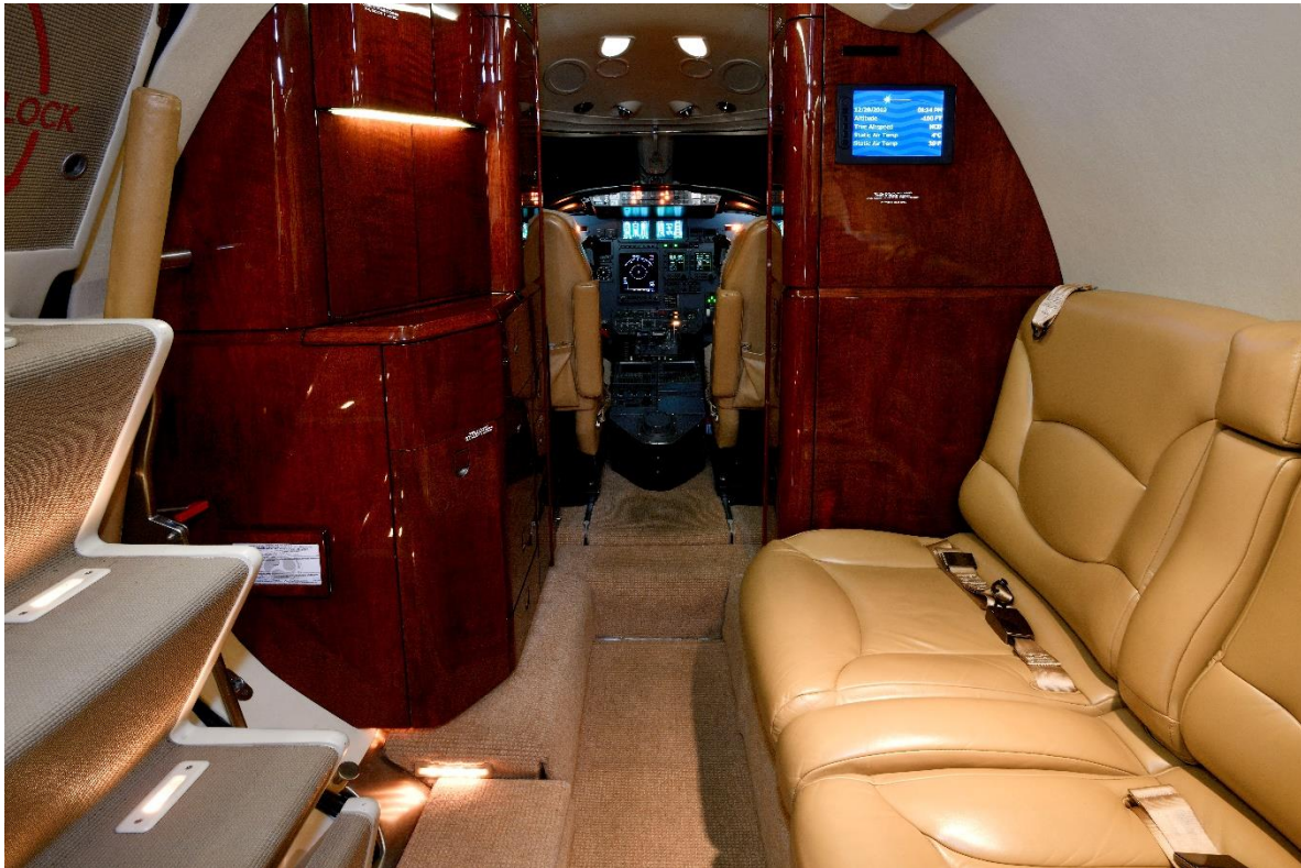
Forward Refreshment Center