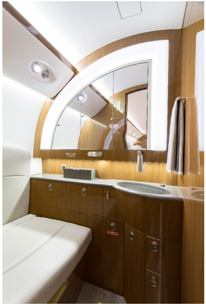
Forward Galley Aft Lavatory