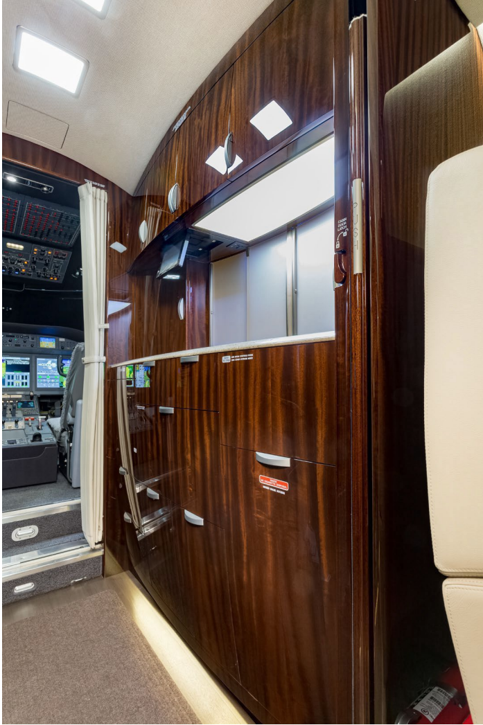
Forward Galley Looking Forward