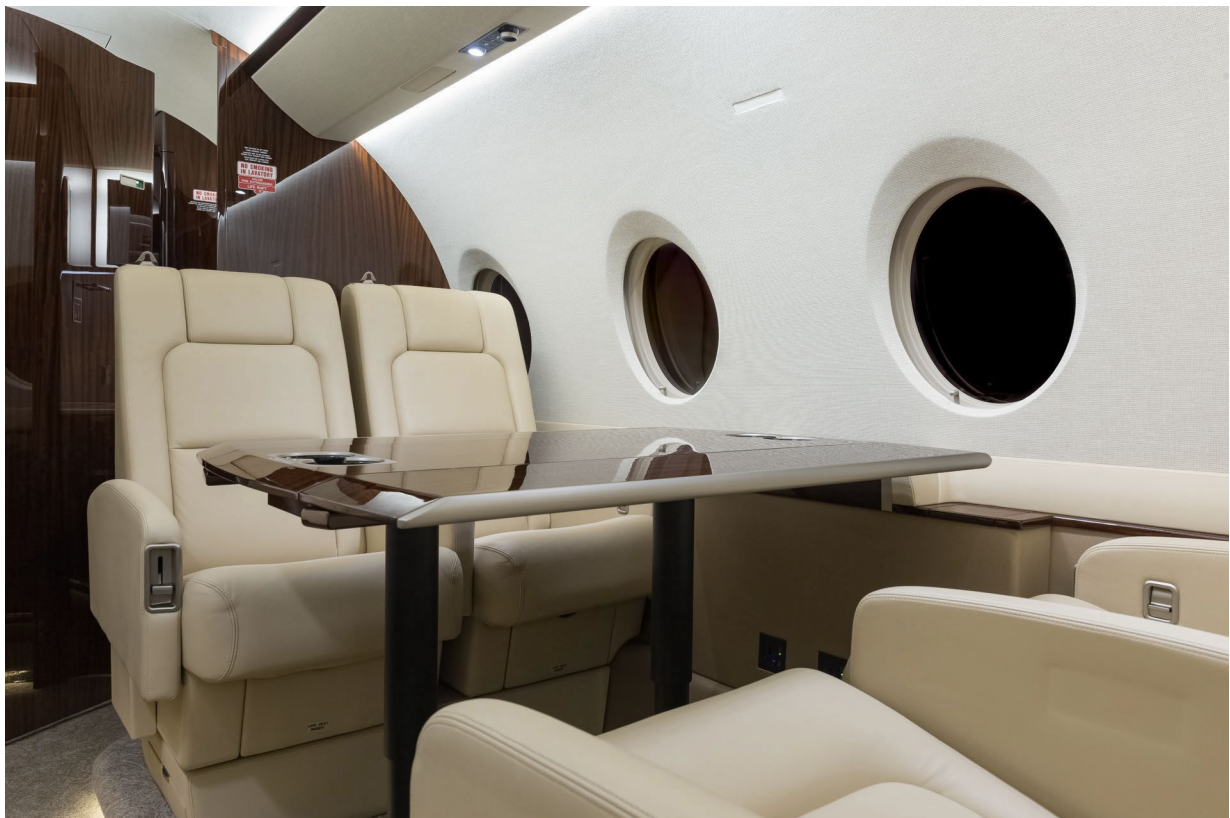
Aft Conference Group