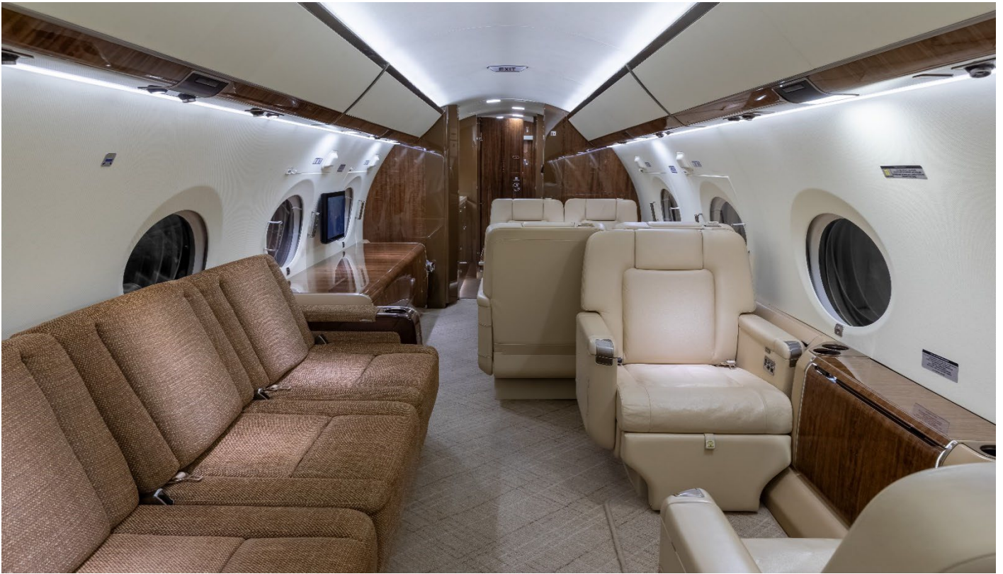
Mid Cabin looking Aft