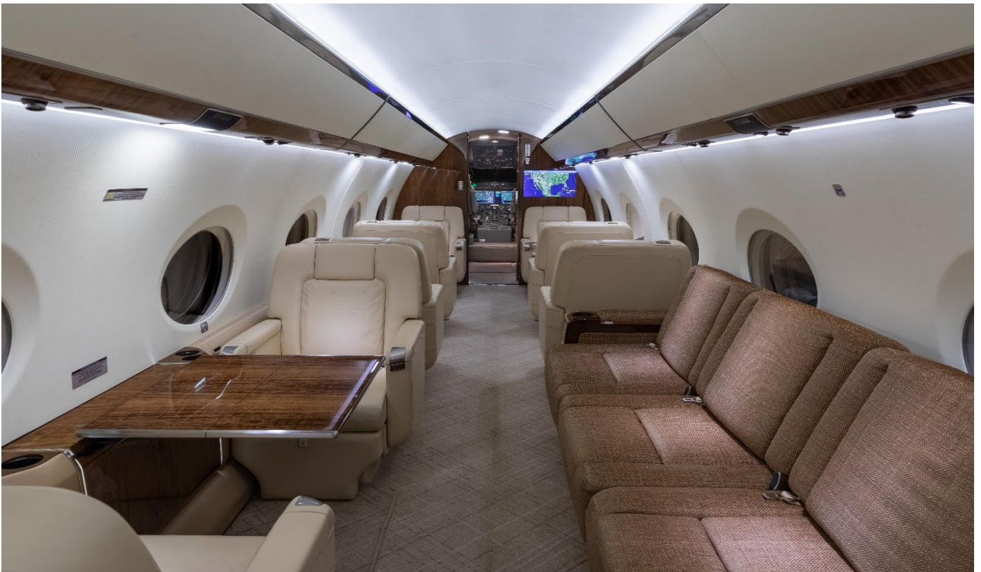
Mid Cabin looking Forward