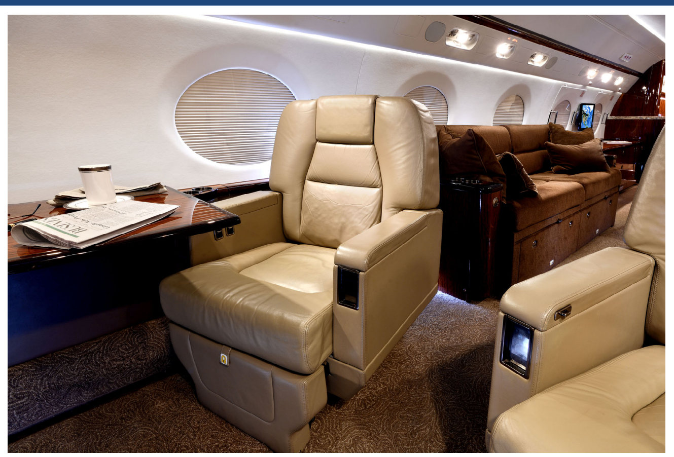
Left Hand Seat Forward Cabin