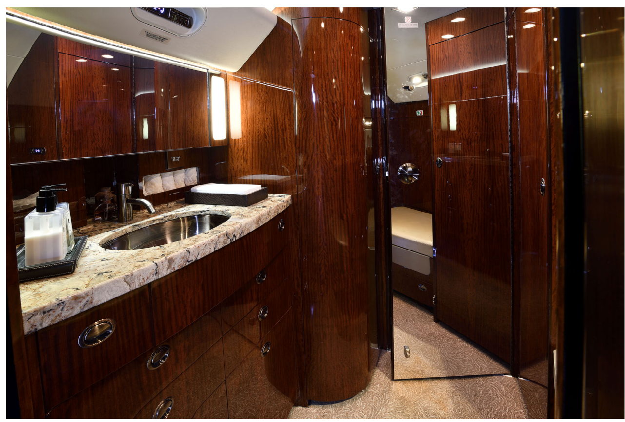
Aft Cabin Lavatory