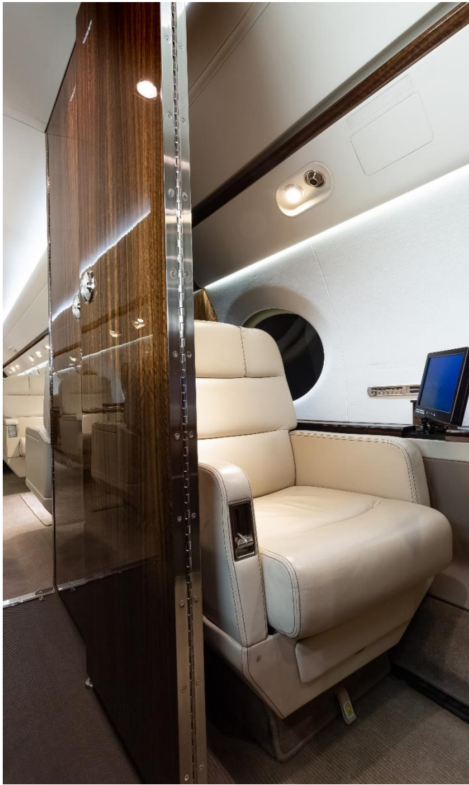
Forward Crew Rest