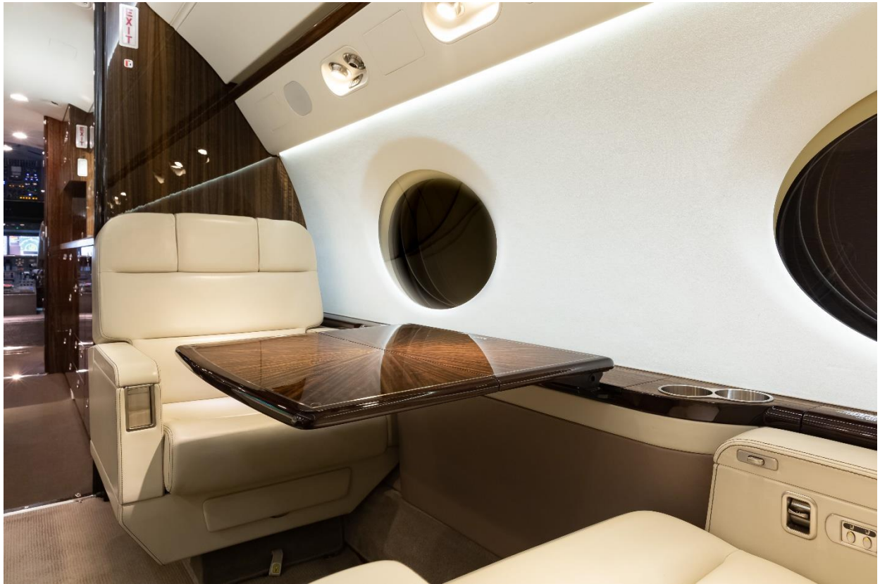
Right Hand Seat Facing Forward