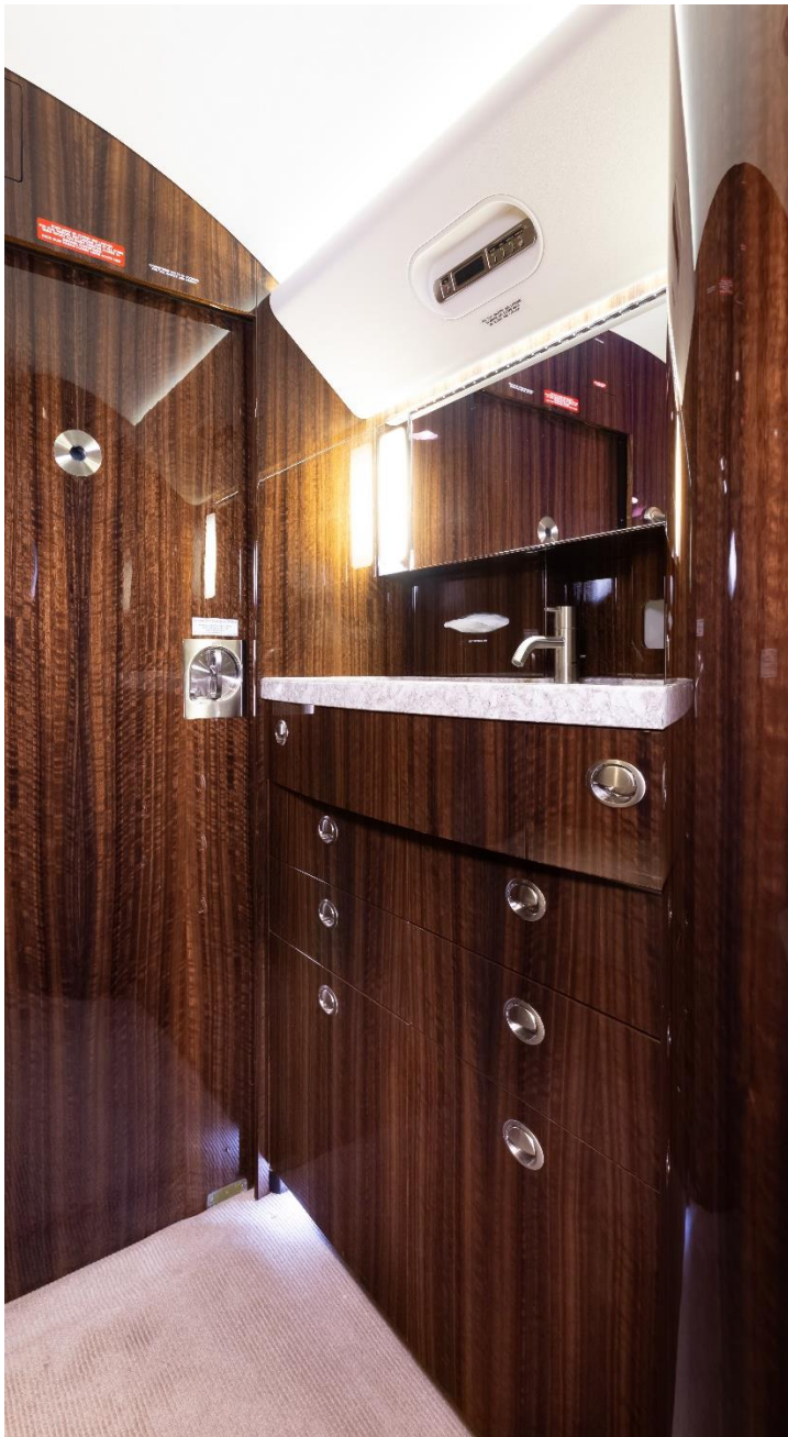
Aft Cabin Lavatory