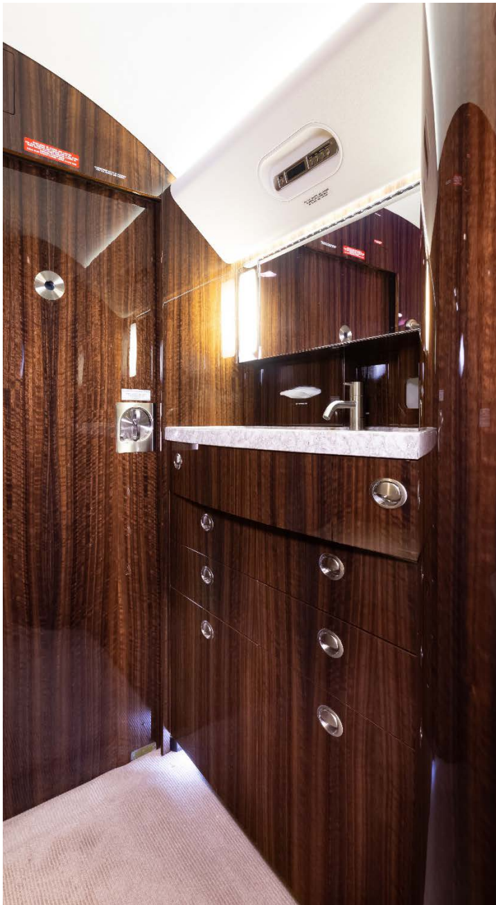
Aft Cabin Lavatory