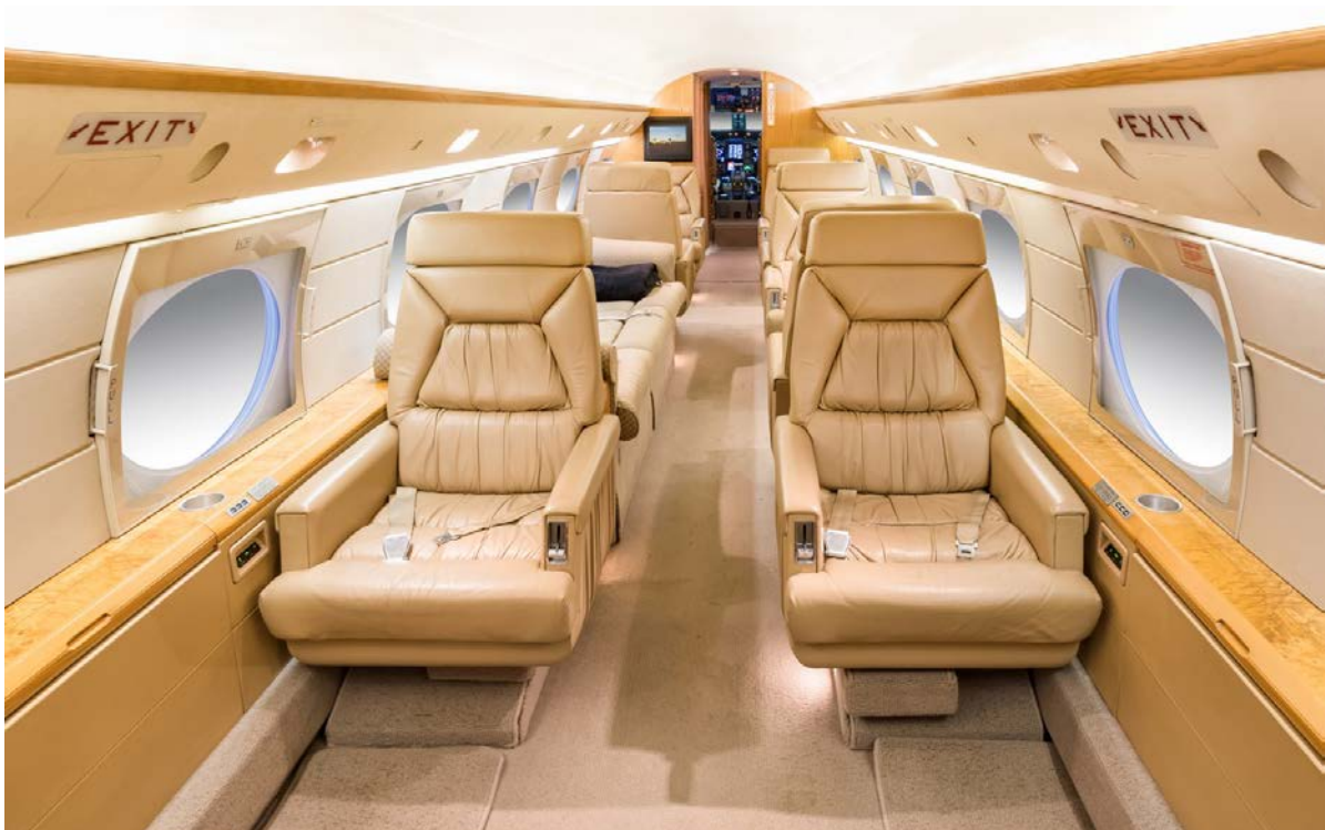
Aft Cabin looking Forward