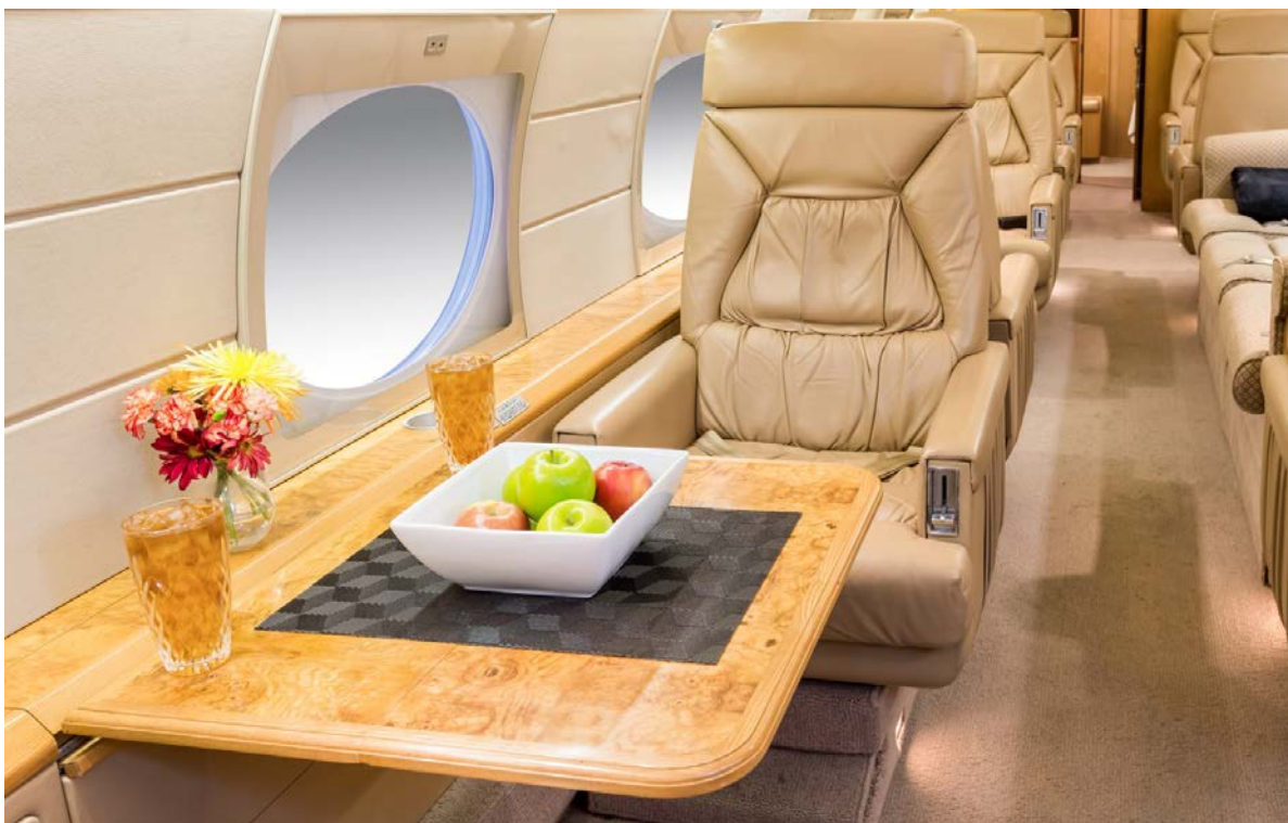
Right Hand VIP Seat Facing Forward