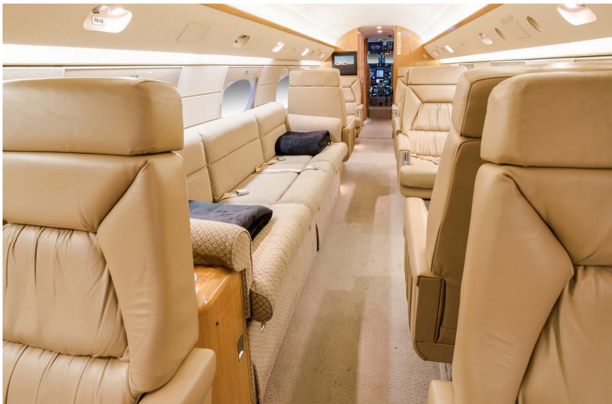
Mid Cabin looking Forward