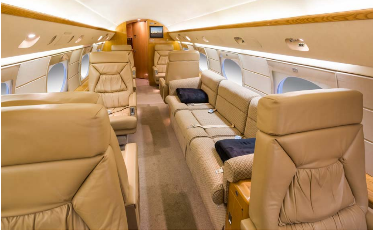
Mid Cabin looking Aft