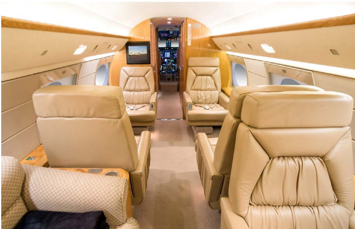
Forward Cabin looking Forward