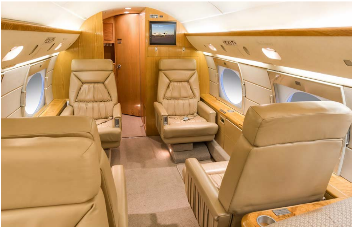
Aft Cabin looking Aft